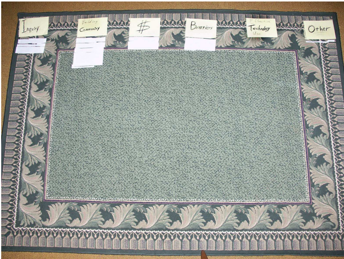
Figure 4.6 Friday's Theme Breakdown

For the first time, other themes began to rival inquiry. A little more time was spent on monetary issues and how money would be disbursed to the teachers for their stipends and their classroom use. No technology discussions took place during this shortened day of wrap-up.