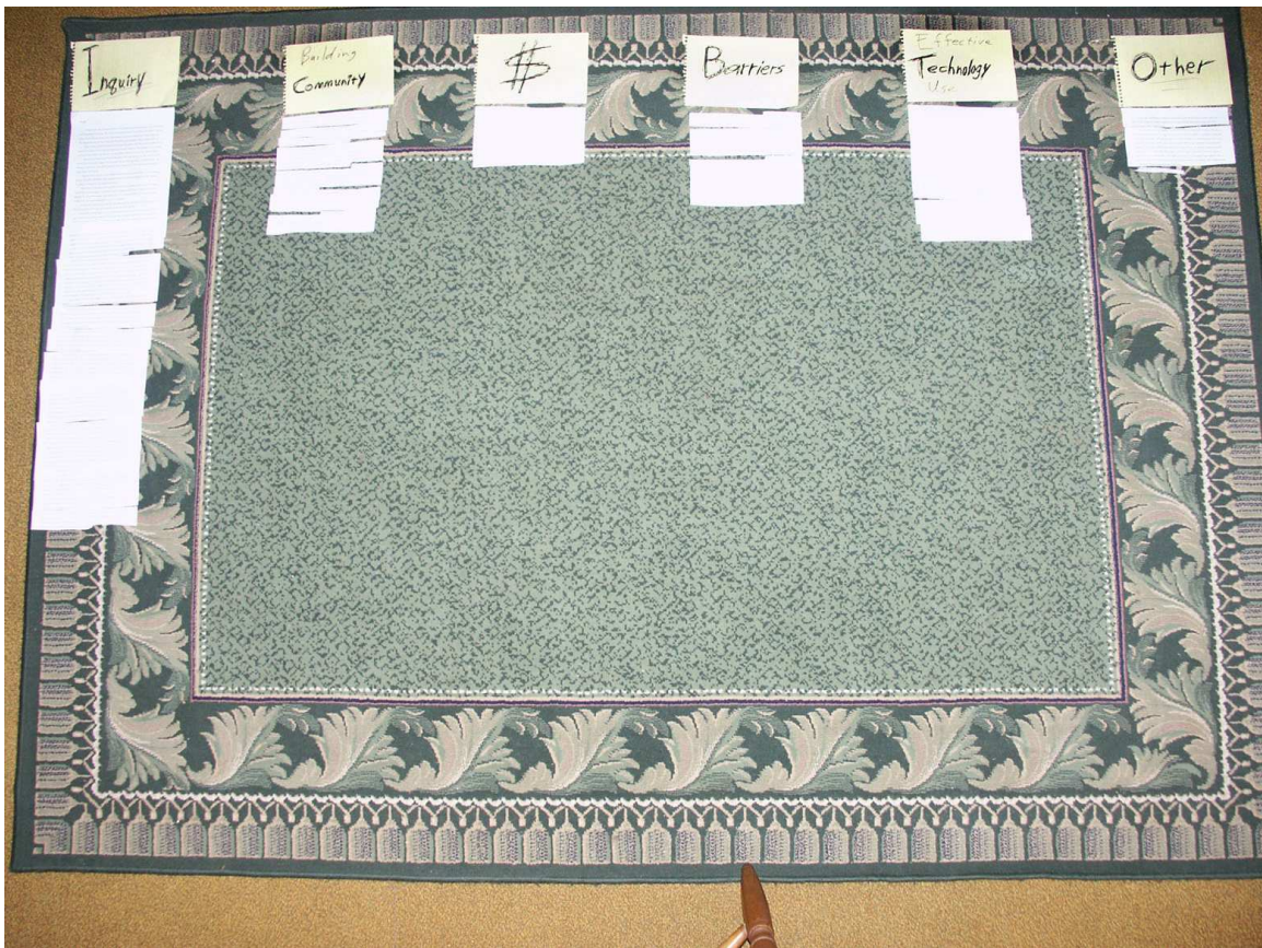
Figure 4.5 Thursday's Theme Breakdown

The teachers continued the day attempting problems and talking about the effective use of inquiry. Inquiry made up about 32.5 inches (46.1%) of the day's transcripts, building community had 9.75 inches (13.8%), monetary issues had five inches (7.1%), barriers and concerns had 7.75 inches (11%), technology had 11 inches (15.6%) and other issues had 4.5 inches (6.4%) of transcripts.