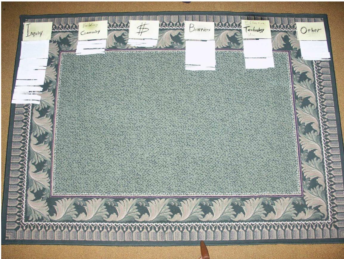
Figure 4.4 Wednesday's Theme Breakdown

Once again, barriers and concerns and technology were heavy themes. The percentage of inquiry was steady at close to 40%. But most notably, the spending of the classroom money and the stipend were being discussed for the first time since Sunday evening.