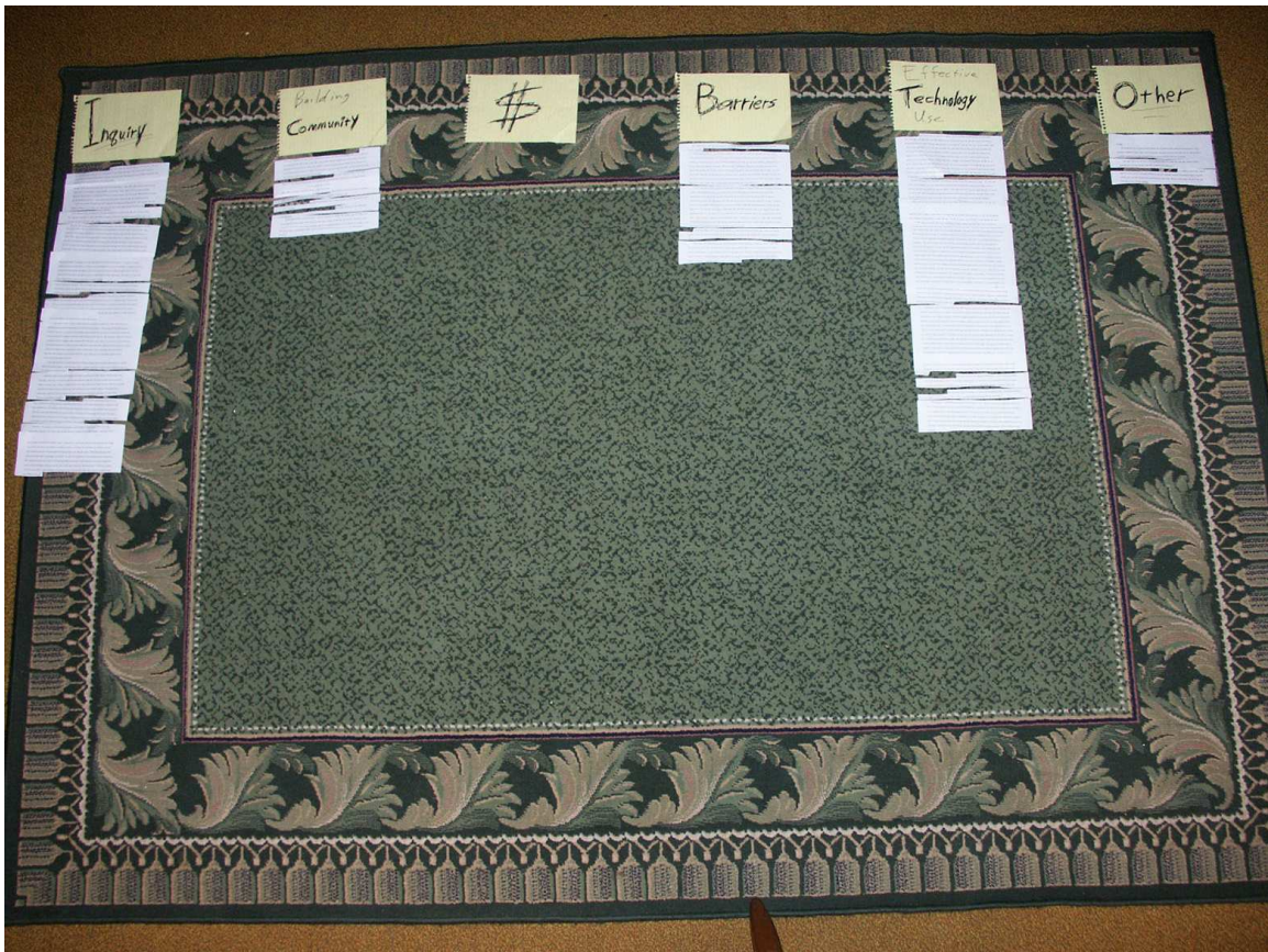
Figure 4.3 Tuesday's Theme Breakdown

On Tuesday, the inquiry theme was not as prevalent as it was on Monday.