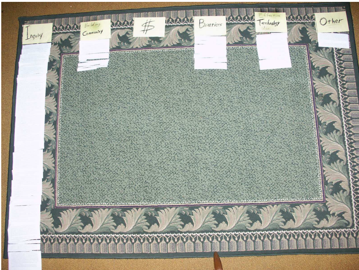
Figure 4.2 Monday's Theme Breakdown

The rest of Monday continued in this way. The inquiry theme overwhelmed the others. When measured, the theme columns were 61.5 inches (64.7%) of inquiry, nine inches (9.5%) on building community, no discussion on monetary issues, 9.75 inches (10.3%) of barrier and concern issues, 10.5 inches (11%) of discussion on technology use and 4.25 inches (4.5%) of various other discussion.