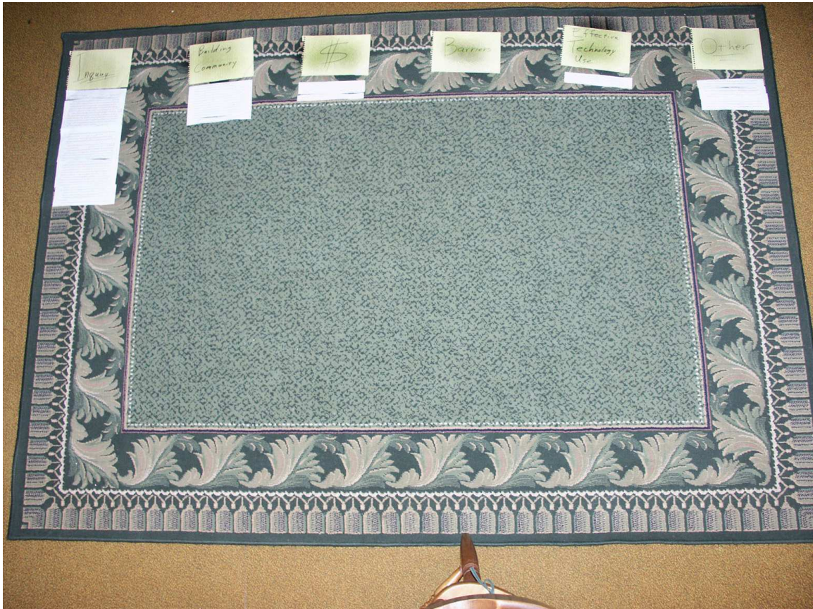
Figure 4.1 Sunday's Theme Breakdown

The photo below is of the theme breakdown from Sunday evening's Inquire meeting. From left to right the topics are inquiry, building community, monetary issues, barriers and concerns, technology use and other.