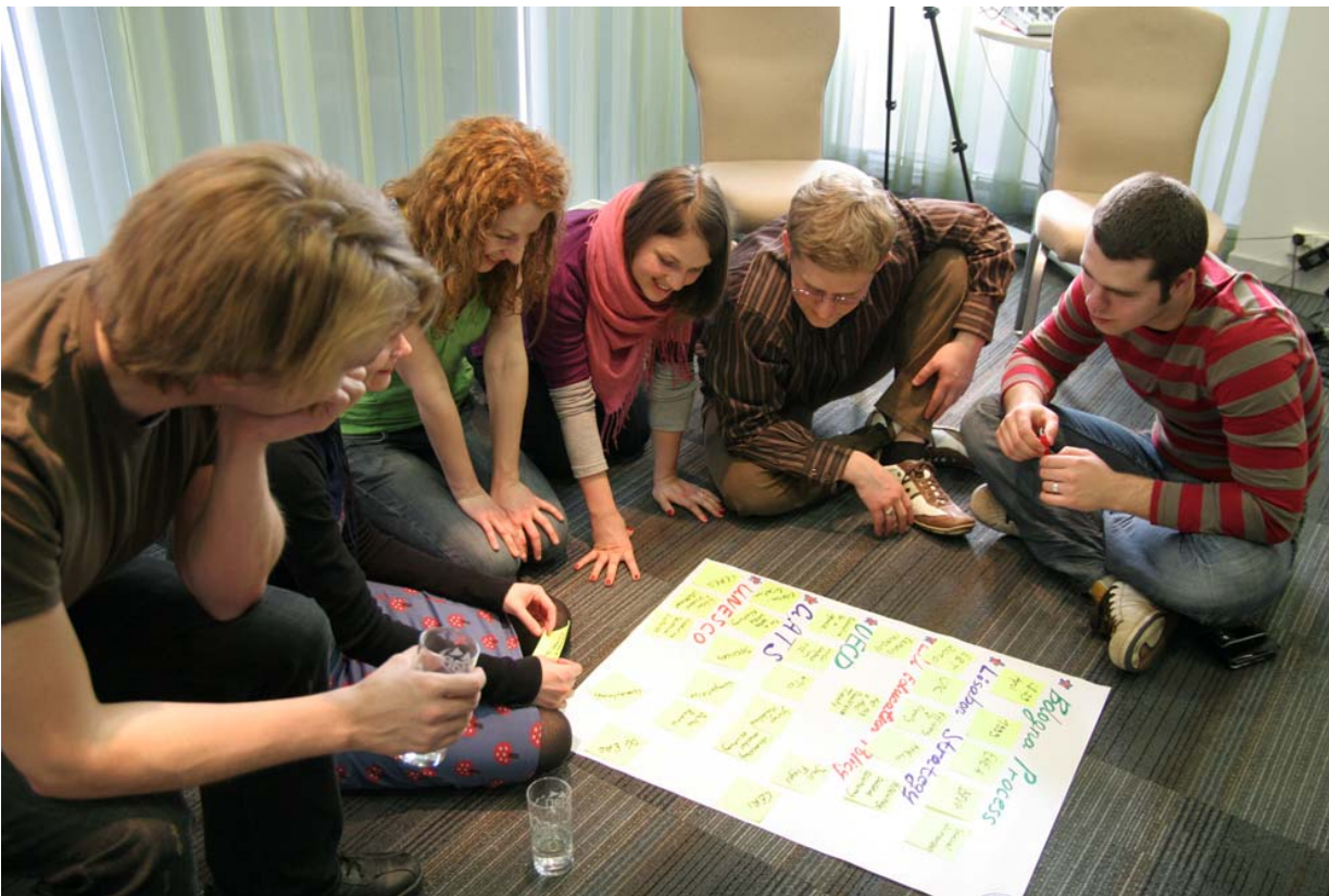
Participants at the Equity training in Tallinn discuss processes and actors that influence higher education

ESU's political aim was to move the national governments towards concrete commitments in the field of social dimension/ equity. Through the European Commission-funded Equity project we aimed at building the European and national student knowledge for a better impact of the students' views in the reform processes simultaneously happening in the European Higher Education Area and European Union setting. Furthermore, ESU aims to achieve a gender balanced student and academic staff body, while implementing our internal Gender Mainstreaming Strategy.