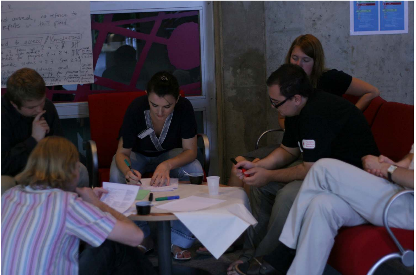
Participants discuss education quality at a quality assurance study session at the Council of Europe’s Youth Centre in Strasbourg

called transparency tools . This position aided in reaching the final content of the communiqué. See also the chapter “Enhancing the student contribution to the Bologna Implementation” below.