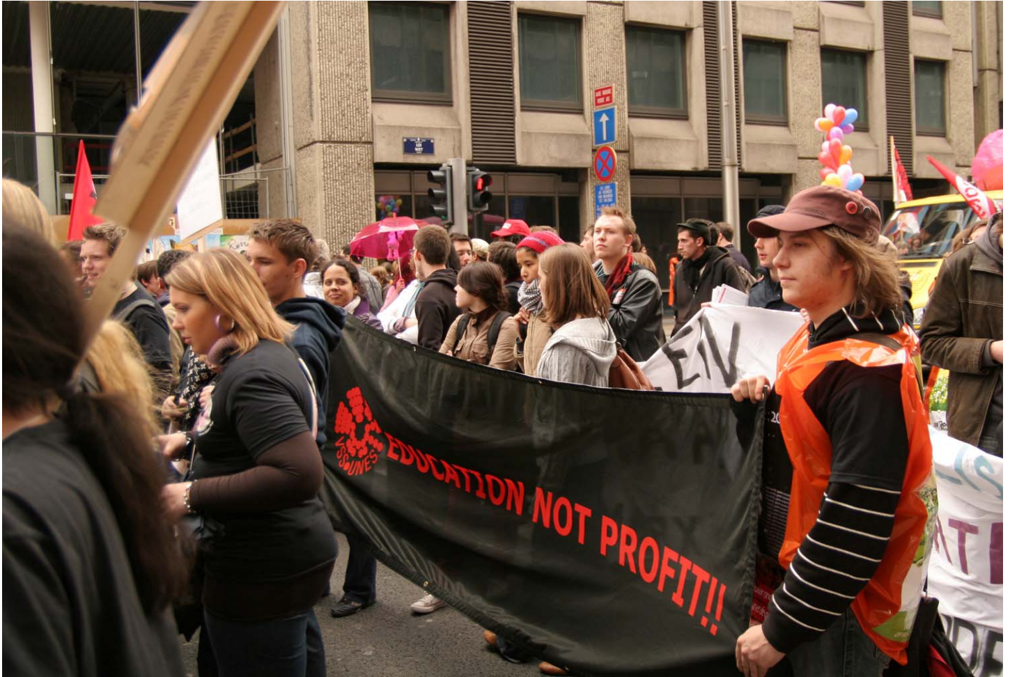
Representatives of ESU's Swiss member VSS-UNES-USU march in Brussels with Belgian and international students in a campaign against commercialisation of higher education

A content package with an overview of research on the topic of the equity is available on the ESU web site. An e-learning platform was developed by the ESU partner organisation SCIENTER, and has several trainings developed by the Social Affairs Committee and ESU's pool of trainers. Three regional equity trainings were organised in Romania (Timisoara), Estonia (Tallinn) and Vienna (Austria).