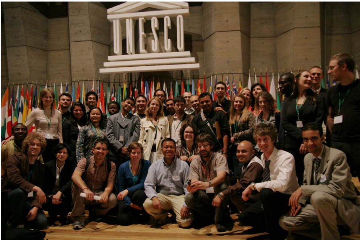
Student representatives at the UNESCO World Conference on Higher Education in July 2009

Together with ESU's International Cooperation Working Group, ESU's Executive Committee worked hard to reinforce the global cooperation between student platforms. The final result was the full preparation of 2 meetings of international student NGOs and regional student platforms in Paris ( January and July 2009), which increased the student message to the UNESCO World Conference on Higher Education (WCHE+10) through the Global Student Statement . The meetings of the regional platforms was essential for the work on mainstreaming the students' voice into the communiqué of the UNESCO WCHE+10 . Also, it enabled ESU to start a structured work towards setting up a new global student dialogue system.