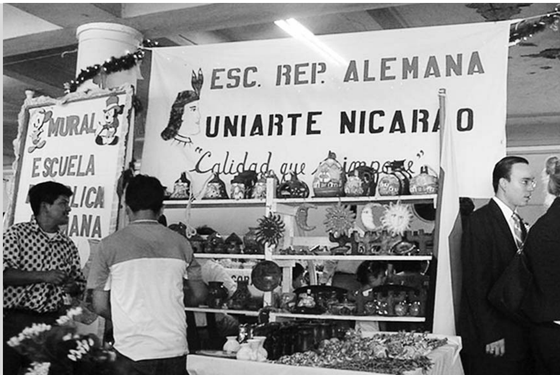
<< The School Business Fair stand from Escuela Republica Alemana

Following the AMCHAM vision to teach children skills that enhance self-sufficiency, AMCHAM added the Laboratorios Empresariales , or School Business Activity, to train directors, teachers, and parents to help students to run school businesses through a partnership with the Universidad Centroamericana (UCA) in Nicaragua. This innovation brought entrepreneurial ideas and practices to schools and assisted students and communities to become more self-reliant. Led by business students from the UCA, the training sessions were extremely well-attended and introduced business concepts such as business plans, team work, quality control, and meeting deadlines. Because the project had helped strengthen the school councils, community members were well-organized and prepared to quickly implement the school businesses. AMCHAM highlighted the student’s products at an annual School Fair event attended by the U.S. ambassador and the Nicaraguan president.