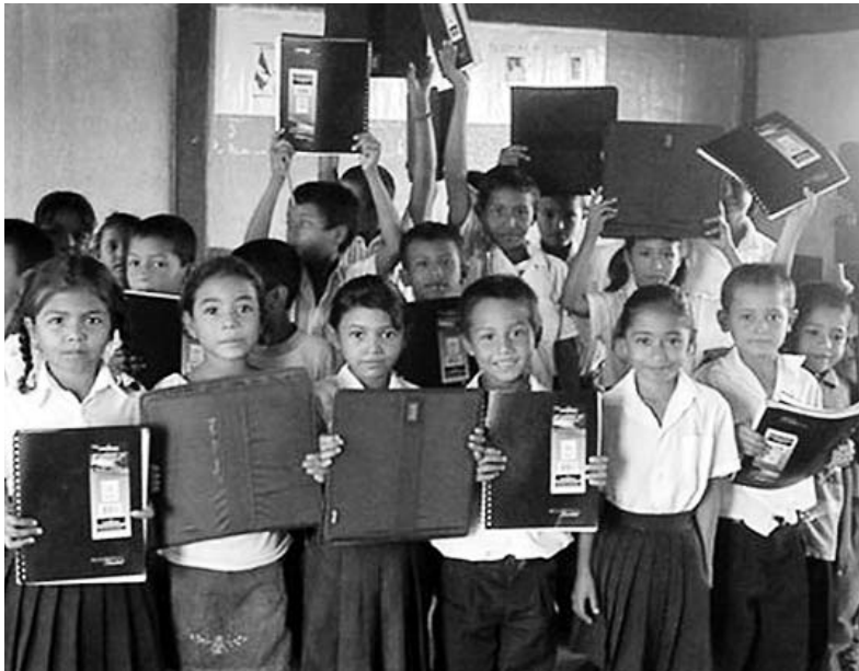
Students receiving donated materials

Currently, there is growing recognition within the Nicaraguan private sector that economic growth is linked to addressing serious development problems such as the poor quality of education. Private-sector leaders are now identifying the need to become more involved in addressing this challenge, and their active participation in the GDA/MSE project proves that there is increased interest in incorporating CSR into their strategic business plans to improve the quality of education in Nicaragua.