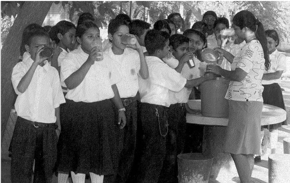
Milk distribution program in ANF school >>

The GDA project helped AMCHAM sponsors maximize their impact on the schools. Through GDA, many sponsors learned to focus their