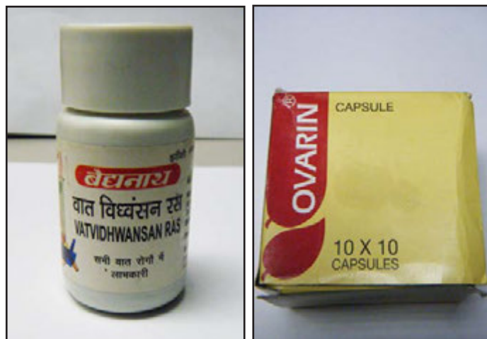
FIGURE. Two of 10 Ayurvedic medications associated with lead poisoning in six pregnant women — New York City Department of Health and Mental Hygiene, 2011–2012