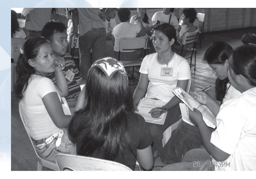
Education Watch Enumerators' Training Workshop conducted in Toboso, Negros Occicental on 26 April 2006 in preparation for the local survey covering four barangays of the municipality