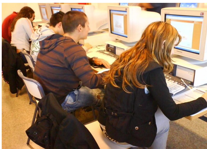
Figure 2. Testing conditions in the IB PAU (2008 version).

As can be seen, the development of the testing interface (Fig. 3), the buttons and the navigation elements were reduced and also followed the design principles stated by Fulcher in 2003. This interface design has been informed in a number of papers (Garc ía Laborda, 2009).