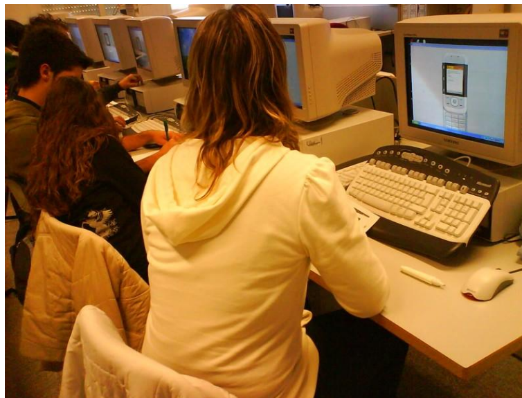
Figure 4. Mobile testing through the use of emulators.

The most significant advances, however, were made in relation to the students' adaptation to the computer-delivered language testing. A number of studies evinced that, although students may face the test for the first time, they can adapt easily to most tasks. Overall, the ones to which students adapt more easily are those that can be responded with a tick or response selection (such as multiple choice tasks). Field studies also found that, despite the teachers' attitudes, most difficulties were associated to writing. Other aspects of research included the use of mobiles for testing through a testing emulator (Fig. 4).