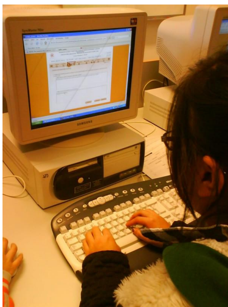
Figure 1. High school student takes the IB PAU (2008 version).

The results were obtained through experimentation of software and, above all, interface information. In some papers, the research group found that students would be able to adapt to the new test delivery system (Figs. 1 and 2).