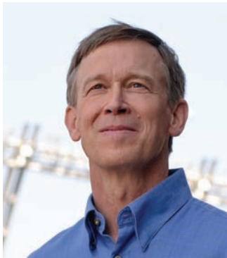
ECS 2011–13 Chair Governor John Hickenlooper, Colorado

ECS was established in 1965, by state leaders for state leaders. For more than 40 years, ECS has been helping policymakers improve public education by facilitating the exchange of information and ideas across states. A nonprofit interstate compact with 350 commissioners from its member states, ECS is the leading nonpartisan source of information, ideas and leadership on education policy. It tracks trends, translates research, provides advice and creates opportunities for state leaders to learn from one another.