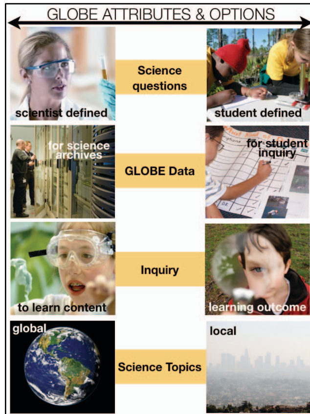
Figure 2. Examples of the range of options for GLOBE attributes that underpin inquiry-based learning. For example, science topics can either be globally or locally defined and data can be collected for scientific studies or for the benefit of student inquiry.