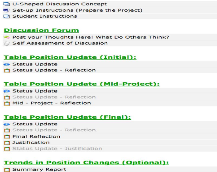
Figure 2. Course manager framework for setting up debate within Moodle.

The object provides for tracking and displaying positions of the group and individuals as well as documenting evidence and arguments made as the discussion proceeds.