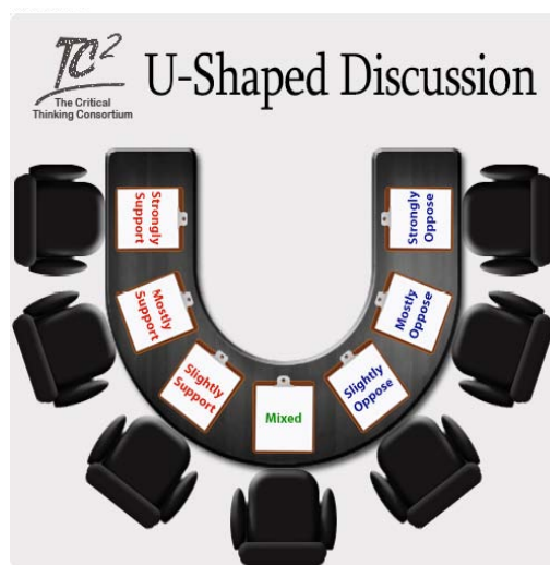
Figure 1. The U-shape discussion.

The proposed Type III design addresses the need to embed CT pedagogy as a means of meeting the goal of teaching CT. The author is doing this by adapting the Type II characterizations as Type III objects (see Table 2). The “Tools for Thought Development Projects I & II” involves a group of developers addressing the Type III criteria by designing objects intended for use within distance learning environments or within live K-12 classrooms and lecture hall practice. Below, the author briefly describes four of the 14 objects currently under development as well as provides a link to a pilot video illustrating the sort of CT embedded support material accompanying the use of the objects.