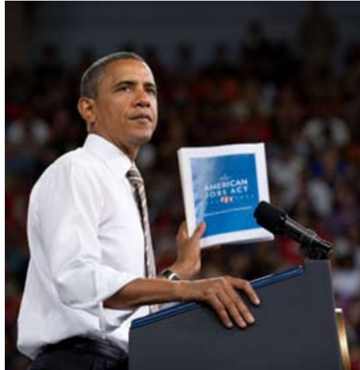
President Barack Obama talks about the American Jobs Act at North Carolina State University, Sept. 14, 2011.

The president's jobs package covers a waterfront of initiatives costing an estimated $447 billion. One part of the bill authorizes $30 billion to help school districts and state-funded early learning programs retain existing employees or rehire former employees. Nearly 90 percent of the funds would go to public school districts, but up to 10 percent would be available to employ early childhood educators.