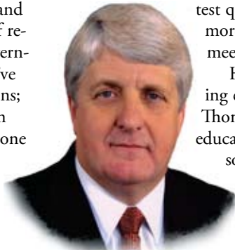
Rep. Rob Bishop (R-UT)