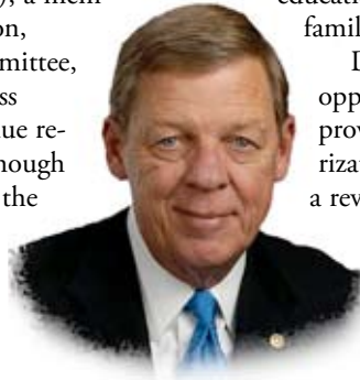
Sen. Johnny Isakson (R-GA)

In response to a question, Miller said he hoped the specific funding for technology initiatives that currently exists in ESEA would be retained and increased. And to another questioner, he affirmed that he and his staff take "very seriously" the concerns from the private school community that resources for equitable services are being diverted through off-the-top allocations under Title I, noting that private schools "are an educational resource in our community and the country."