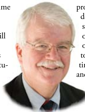
Rep. George Miller (D-CA)