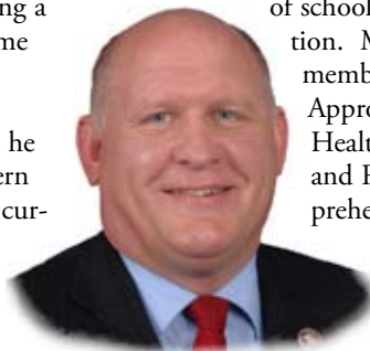
Rep. Glenn Thompson (R-PA)