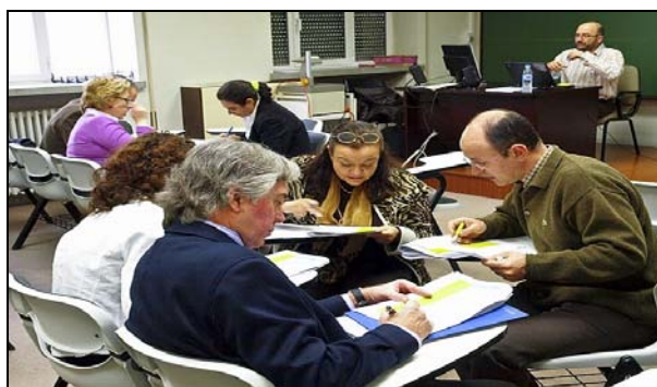
Figure 3. Assessment workshop. (2009, February)

We have also organized training activities for lecturers and administrative staff in educational subjects such as methodology, assessment in different computer applications and virtual learning platforms (see Figure 3).