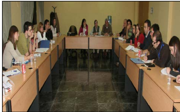
Figure 4. Meeting and participation of a conference in Soto Del Real. (2009, December)

It is said that one of the most important features of the EHEA is changing the role from teacher to student, i.e., the shift of emphasis from the act of teaching to learning. Therefore, the way students accept the new learning process is a priority. In the EUATM, the participation of students is motivated persistently, though it is not always easy to get a large group of students involved in school activities. We are particularly working with student representatives as part of a permanent dialogue, to integrate them into all the governing and advisory bodies of the school. For 19 years, meeting and participation conferences have been held annually with students, in which the management team, heads of departments and representatives from professional associations and academic authorities meet with delegates and student associations for three or four days, outside the city, to discuss and reflect on all matters of interest for the teaching/learning process and the future of students (see Figure 4).