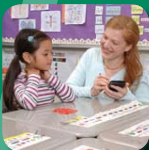
Innovative Teaching and Learning