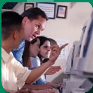
Proficiency in 21st Century Skills