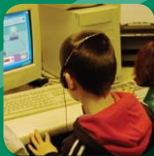
Robust Education Support Systems