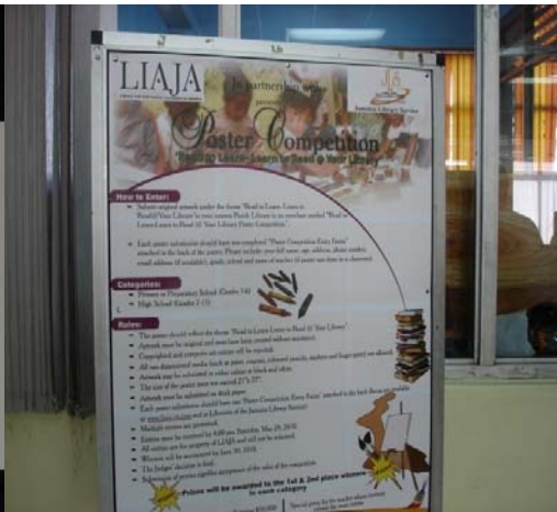
The criteria for the Poster Competition