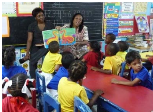
Librarians engaging students in reading activities