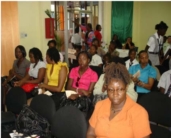
Audience at the launch