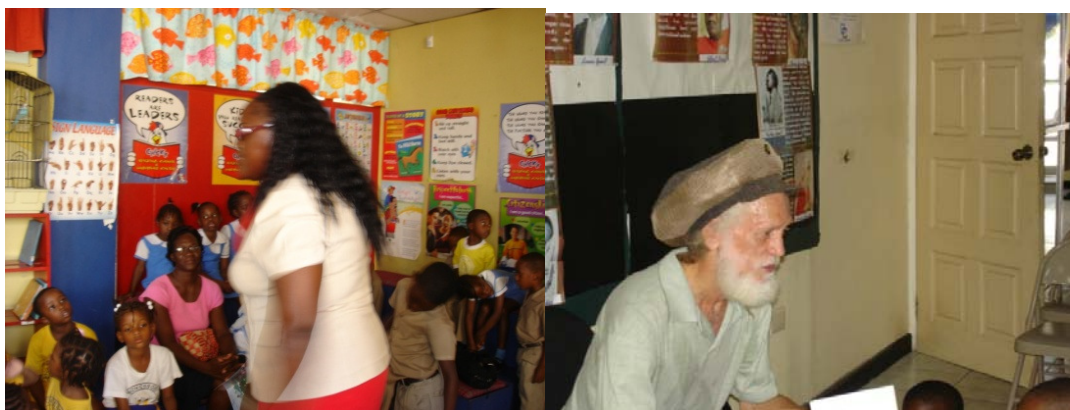
Librarian and radio personality engaging students in literacy activities