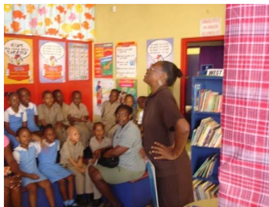
Photographs depicting Reading week activities