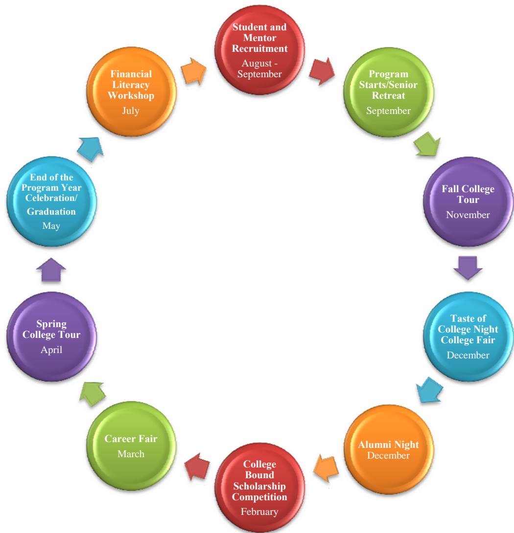
Figure 1. Program year cycle and program components