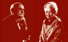
Dr. Milton Friedman, Founder Nobel Laureate and Founder