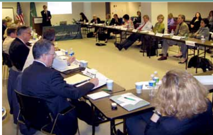
Above: "Museums and Libraries Advancing Global Understanding" convening.

During the course of 2009, IMLS convened three meetings to help the agency move forward in its international work. This update provides information about these meetings and other recent IMLS international activities.