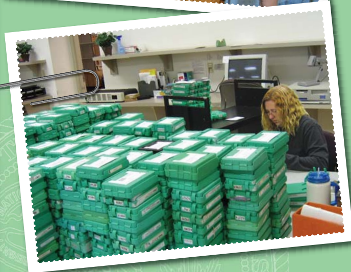
TOP: The annual Small Public Library Management Institute is part of the State Library's acclaimed continuing education efforts.