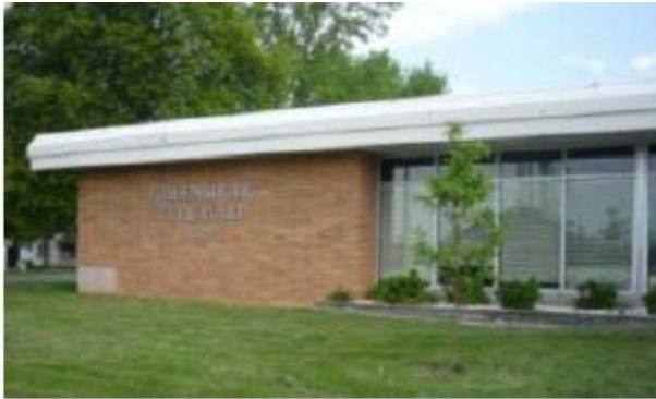
Adaptive reuse – Elementary School into Mayor’s Office and Courtrooms