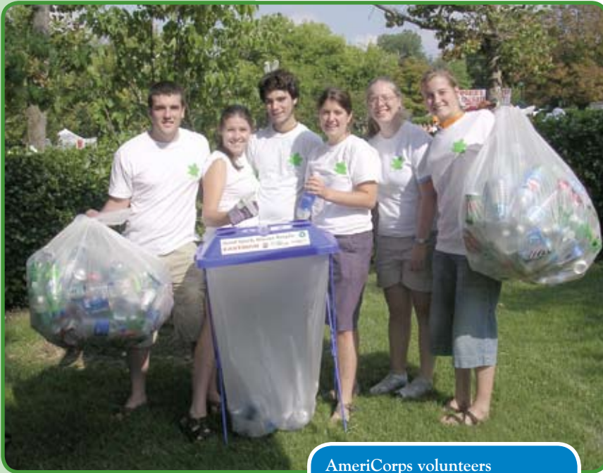
AmeriCorps volunteers occasionally help collect materials for the UT recycling program.

Choosing Materials to Recycle. Stadium officials selected the materials to recycle (and purchase, in the case of the plastic cups used inside the stadium) based on their knowledge of what materials would be accepted by the local recycling facility. Plastics labeled #1 and #2 were selected because they could be recycled locally.