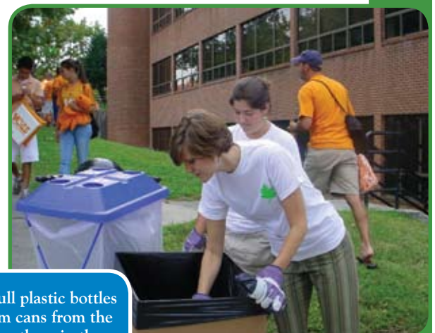
Volunteers pull plastic bottles and aluminum cans from the trash and place them in the adjacent recycling bin.

Solution: The best places tend to have high pedestrian traffic and a high volume of materials, and are often where people are congregated together sitting, eating, and drinking. Regular and congenial interaction with fans—on the parts of the recycling coordinator, facilities and maintenance staff, volunteers, and others with a stake in the recycling effort—can be one of the best ways to ensure success. Fans at UT tend to tailgate in the same place every game, and many end up “adopting” a bin near their chosen spots. According to the UT recycling coordinator, finding the best spots to place the bins may take a few games or even a few years—and coordinators should be willing to modify their placements as necessary over time.