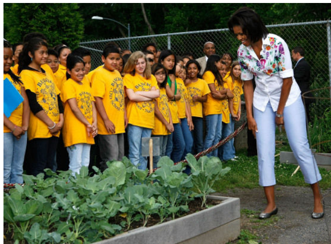
First Lady Obama at Bancroft Elementary School

do not have public open spaces such as parks or social common areas that incorporate physical activity into everyday life. In other cases, existing outdoor spaces may be deemed or perceived as unsafe or unfit for use. Also, many parents do not permit unsupervised play in crime-torn communities, but are often unable to provide this supervision themselves. As a result, children not attending afterschool programs stay inside watching TV and playing video games.