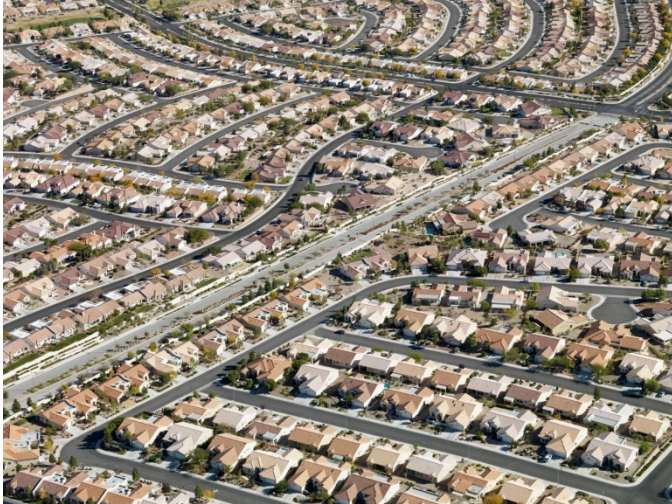
Las Vegas, NV Sprawl

In urban and suburban communities where households once included more families with children and more children in each family, the utilization of schools necessarily declines. This has been offset somewhat by the expansion of early childhood education.