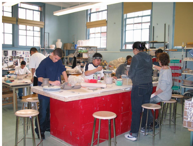
Julia Richman Education Complex Ceramics Studio

throughout the nation there are after-school programs that help families from all income levels.