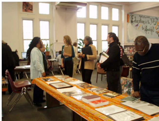
Community art exhibit at Cardozo High School

Finally, there is joint use, either shared or dedicated where the user seeks no relationship with the school or its families but desires access to the location and space in the school. This is real estate joint use. For example, some churches regularly use school auditoria for services and government agencies sometimes locate offices in under-utilized schools.