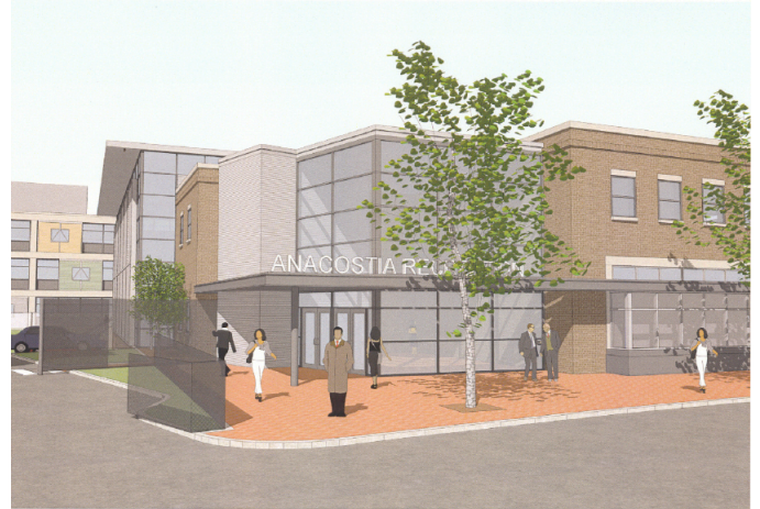
Savoy and Thurgood Marshall Sports and Learning Center

We propose that a fundamental shift is needed in how we view our public schools: a new social contract for the use of our public school infrastructure.