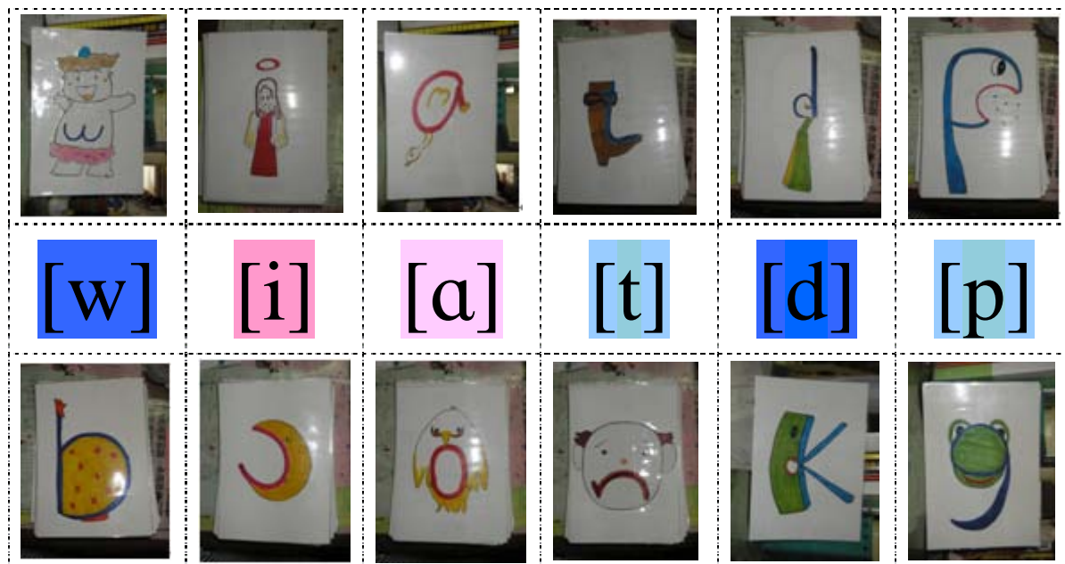
Figure 1: Pictorial representations and corresponding phonetic symbols

38. Drinking / h /: the word 'drinking' sounds the same as / h / in Mandarin.