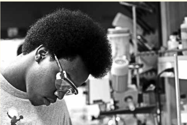
Indiana University–Purdue University Indianapolis

Academic divisions and departments have used NSSE analyses to identify areas of strength and possible areas of concern. Divisional deans received reports of student engagement results in specific colleges as compared to all other students at the institution and for individual departments compared to other students in the division. By drilling down into the data, institutional leaders gained a profile of their students in various majors as well as a comparison to students in other departments and divisions. For example, the institution examined differences in