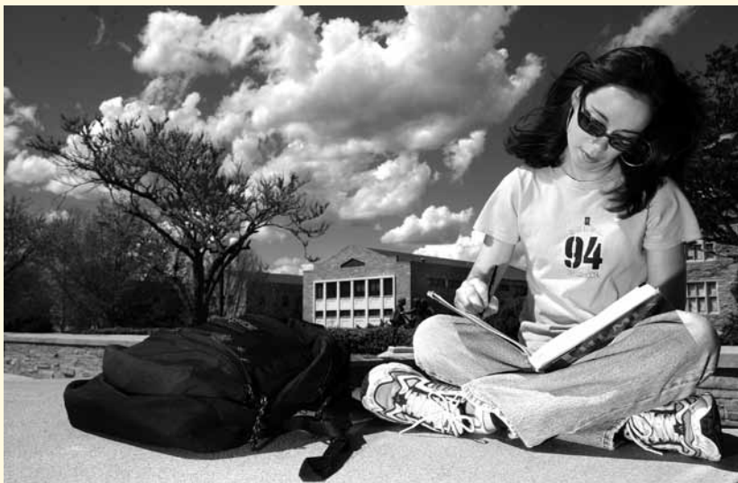
University of Tulsa