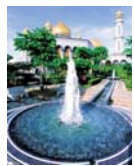
Jame' Asr Hassanil Bolkah Mosque in Brunei