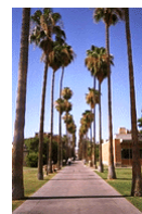
Scenic Palm Walk on ASU West Campus