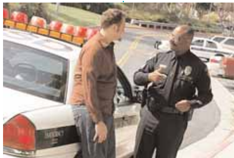
Communication with students is key to violence prevention.