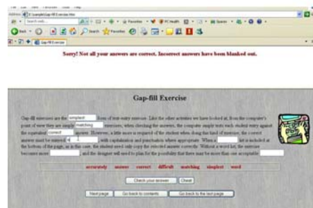
Figure 1. Writing activities on the web

As it is shown in the figure 1 learner can have the chance to reach a vast majority of exercises on the web. In this exercise learners are filling the gaps by using the words that has given. If teachers or facilitators use this kind of exercises and they can bring a different point of view to the classroom because it is easy to explore. Learners do not have to use pen or pencils to write or erasers to clean. Assessment is also easy here because online learners are responsible for their own process of learning.