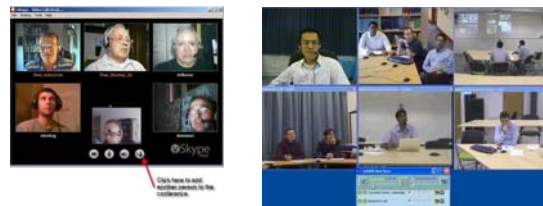
Figure 4. Speaking activities on the web

Most users are familiar with their own electronic mail systems and, in the case of a conference that extends over many sites; there are personnel at each site who can provide training and support for their site's users. Participants are expected to be proactive in sorting and storing the messages themselves. The advantages of computer conferencing include interacting at a distance with other students and the instructor, rather than studying alone. Computer conferencing can be independent of time and independent of distance. Moreover, videoconferencing enables students to speak other peers, mentors; who are native speakers, this gives them the chance of comparing their pronunciation with that of native speakers. Guest "lecturers" can be invited into join the conference, so students can interact directly with experts in their fields (Cotlar and Shimabukuro, 1995). Videoconferencing is also providing a face to face interaction to students. A virtual community can be built that provides support and encouragement and promotes sharing among the participants and can help overcome the isolation of remote areas (Singletary and Anderson 1995; McAuley, 1995).