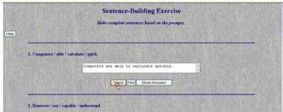
Figure 2. Sentence building exercise on the web