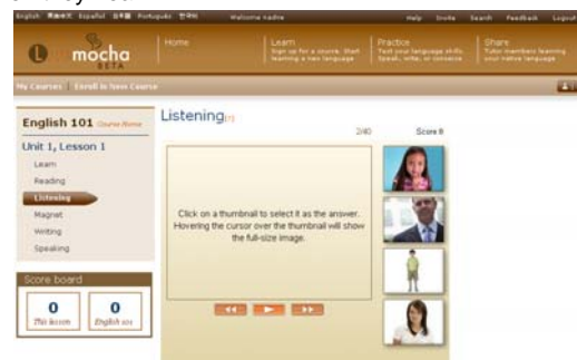
Figure 5. Listening exercise on the web

In this activity, students are listening what the tutor says and then do the exercises. This kind of activities is beneficial for students because they can develop their pronunciation when they hear.