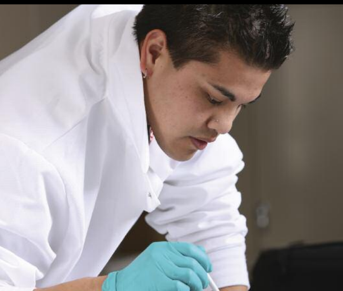
Northwest Indian College connects tradition to tomorrow: Page 10