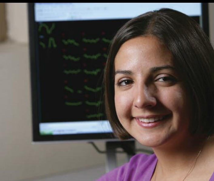
At the University of Texas at El Paso, the border is no boundary: Page 2