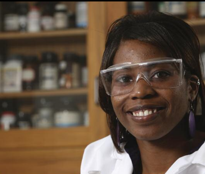
Alcorn State University takes a holistic approach to student success: Page 20