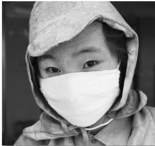
WORKER: The senior managerial staff of the personnel department. 29