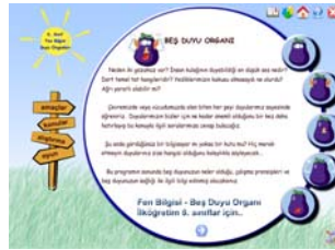
Figure 1: Feel Me! Home page