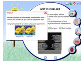
Figure 2b: Subjects page

The subjects are introduced briefly and in a way to meet the behavioral objectives. Furthermore, the information on the pages that include the videos is presented in harmony with the videos, thus the students with hearing problems are kept in touch with the subject (Figure 2b).