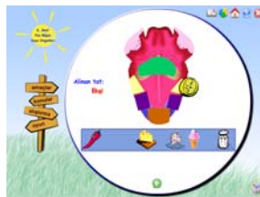
Figure 3b: Exercise page

There are two tests of 20 multiple-choice questions prepared at different levels in the testing part. The first of these tests consists of questions at the level of knowledge and comprehension that cover the general subjects. The second one is more comprehensive and includes questions that require upper-level skills and more comprehension. The questions are prepared as to cover all the subjects introduced and to include equal information about each subject according to the Bloom Taxonomy. Moreover, the answers of the questions found in the tests are equally distributed. At the end of each test is the evaluation page where the responses to the questions given by the students are shown as correct or incorrect. When the numbers of the