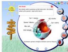
Figure 2a: Subjects page

The “subjects” page can be reached from the “contents” part found on the “subjects” page or from the subject visuals on the general-screen view of the software. On the “subjects” page is information about the description of the senses related to the chosen subject, the structure of the sense organs, the operation of the senses and about the health of the senses (Figure 2a).