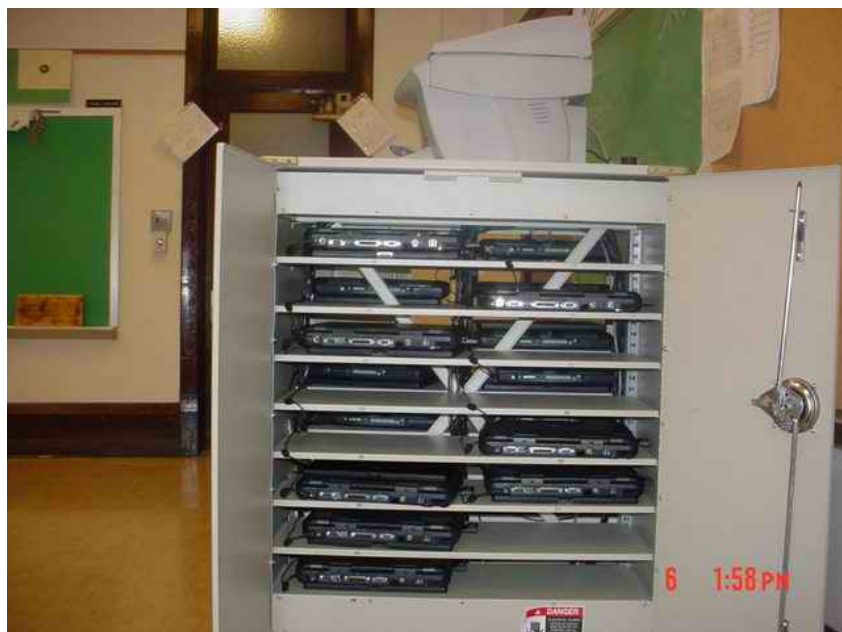
Picture-2 General Classroom View