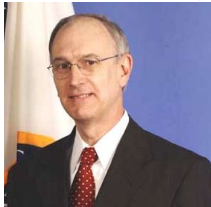
Deputy Secretary of Education Ray Simon