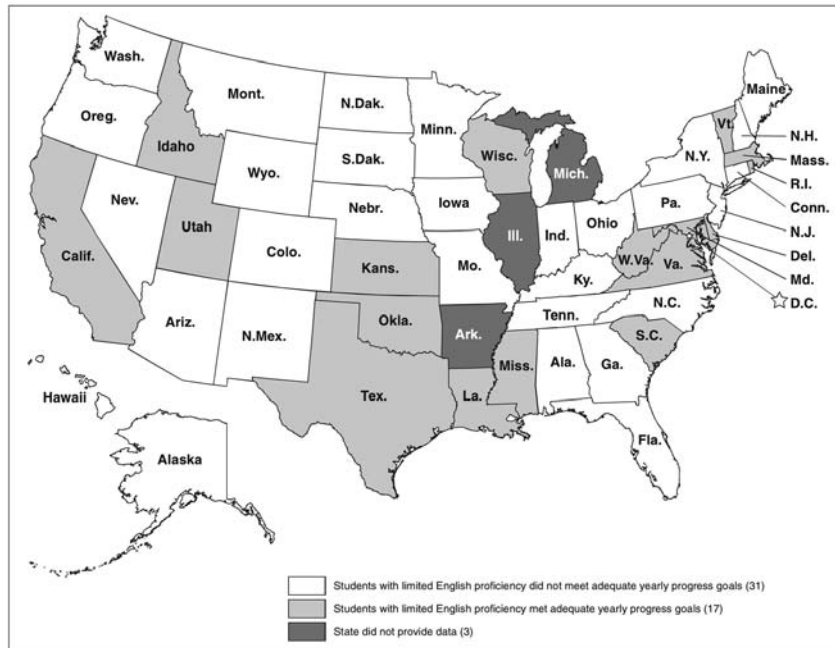
Figure 1: School Year 2003-2004 Comparison of Percentage of Students with Limited English Proficiency Who Achieved Proficient Scores in Language Arts and Mathematics with State-Established Progress Goals

Source: State 2003-2004 report cards available on state Web sites or data provided by state officials. Notes: We obtained data for 42 states from their state Web sites and contacted state officials in 6 states to obtain these data. Three states did not report data in a format that allowed us to determine whether the percentage of students with limited English proficiency met or exceeded the annual progress goals established by the state.