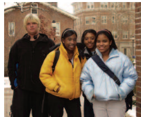
Researchers are capturing the perspectives of students at the Dayton Early College Academy and the Wallis Annenberg High School, as well as those of teachers, administrators, and parents.

DECA started in a very different place from the Wallis Annenberg High School, a difference facilitated by its location on a college campus. WAHS, a K-12 charter school in Los Angeles, has its own facility situated in the heart of an urban community and partners with nearby California State University Los Angeles. University faculty worked with WAHS in its first year to develop curricula in a number of subject areas and to prepare for future university coursework. The high school students did not take college courses in the first year, but 20 students enrolled in college chemistry and philosophy in the summer of 2005.