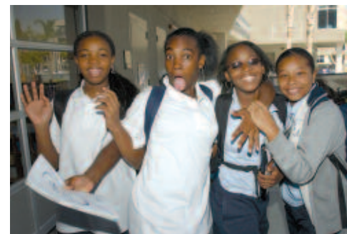
Students' ultimate success in high school may depend largely on how they perceive their future with regard to higher education.

As with meaningful relationships, highly challenging learning opportunities constitute powerful medicine. The exhilaration from the experience of success in accomplishing a challenging task can be transformational for students. Repeated successes of this type come to define high achievement. At the same time, high challenge without high support can feel overwhelming. If learning challenges prove too difficult to accomplish, or if anxiety over the tasks prevents students from using their