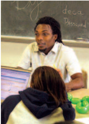
Early college high school advocates believe that the existing comprehensive high school is performing so dismally that innovation is necessary and appropriate.

Advocates of early college high school agree that more research is necessary, but they argue that the existing comprehensive high school is performing so dismally that innovation is necessary and appropriate. Experimentation should not be put on hold while stud-