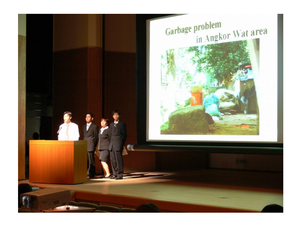
Figure 1. Japan and Cambodia Joint Presentation at the World Youth Meeting.