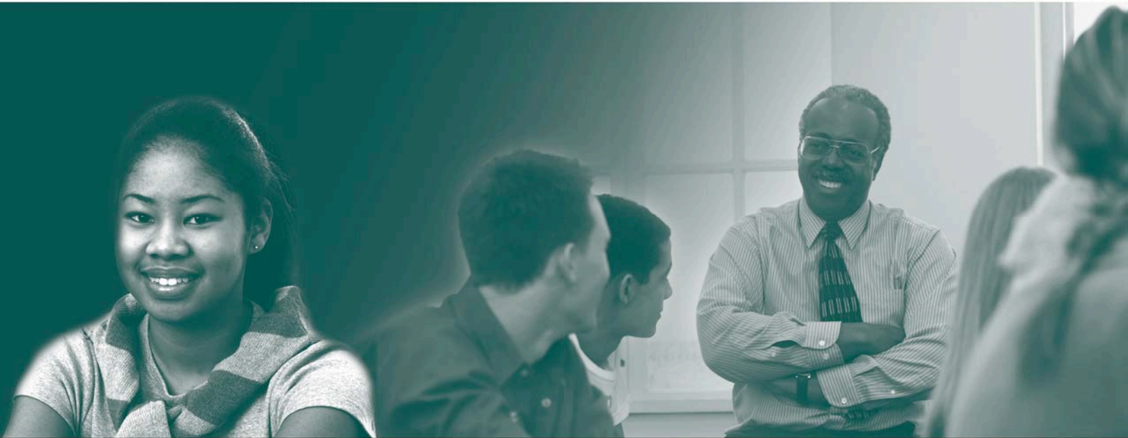
Students in Action v. 150