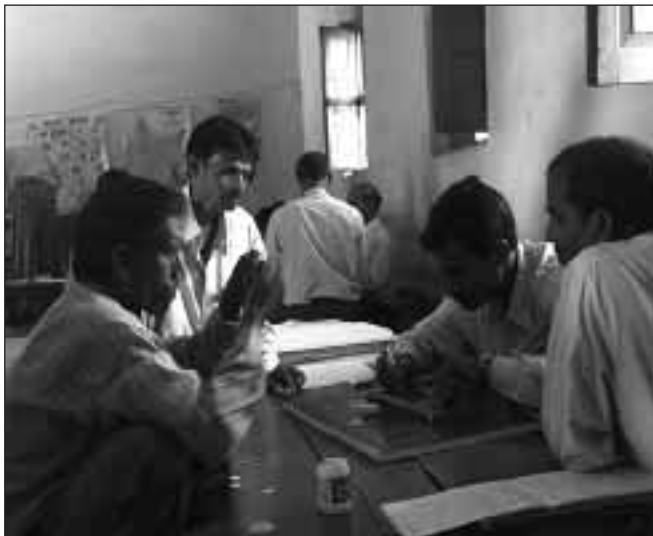
Teacher training in progress.