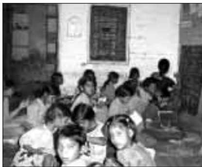
Learning in NFE schools after training programme