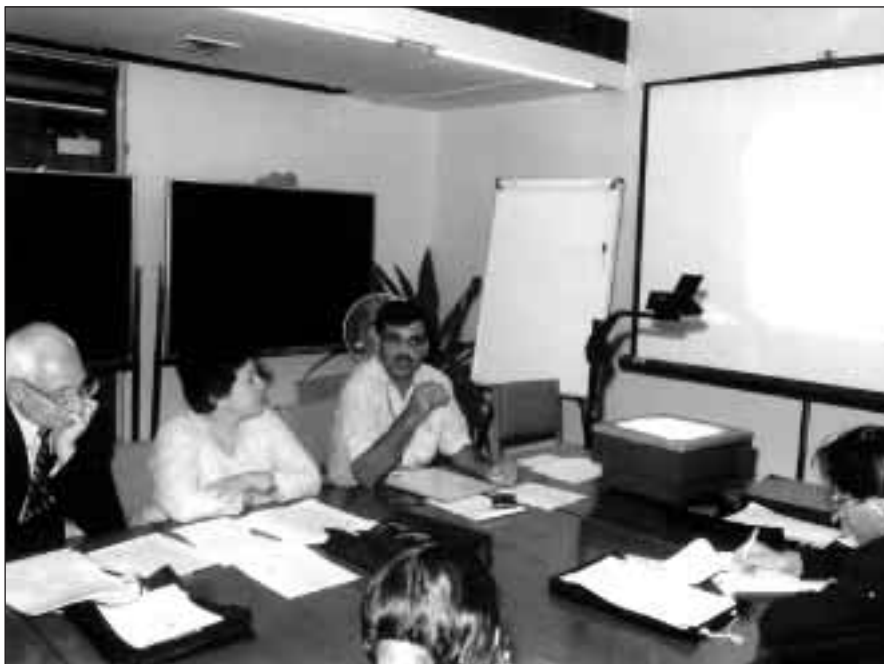
Workshop in progress for development of NFE curriculum.