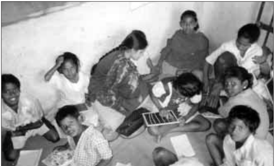
Pupils in NFE school after training programme.

Finally, the community and parents were initially reluctant to support the project due to a lack of awareness about its usefulness.