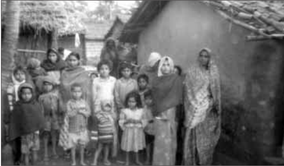
In the village, Uttar Pradesh