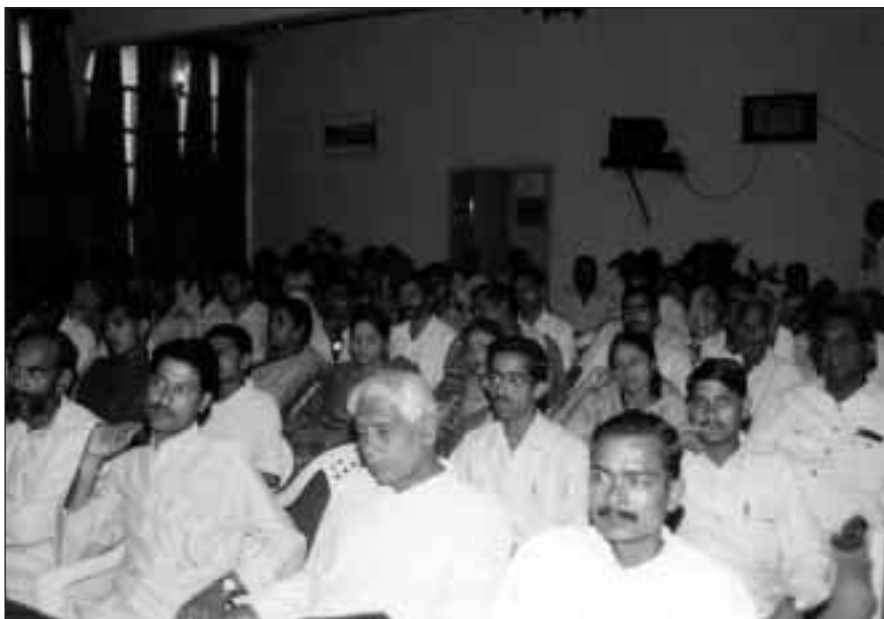
Master trainees and teacher trainees attending a training session.