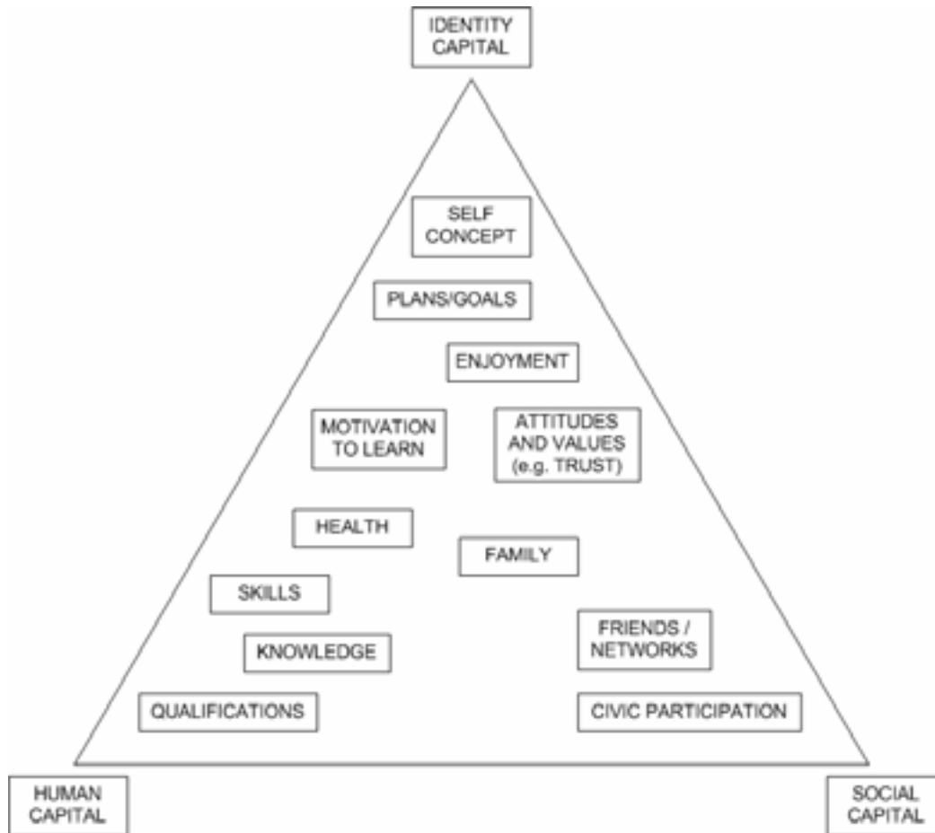
Figure 1: Conceptualisation of the wider benefits of learning (Schuller et al. 2004, p.13)

The items in the triangle in Figure 1 are both outcomes of learning and ‘capabilities’ allowing for further development and benefits. While some are more closely related to one of the three forms of capital, e.g. self-concept to identity capital, the outcomes are not conceived as fixed in their distance from the particular pole or their relationship to each other, and the whole framework is essentially dynamic in nature. Learning is likely to have multiple outcomes, it is ongoing, interactions between outcomes are complex and it is possible to explore links between any two or more outcomes.