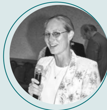
Rep. Bette Grande