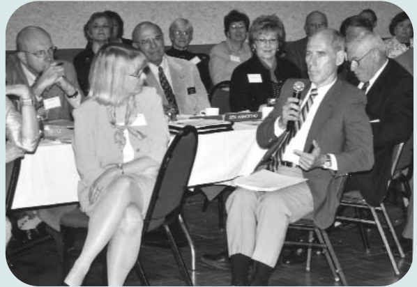
Roundtable members and guests