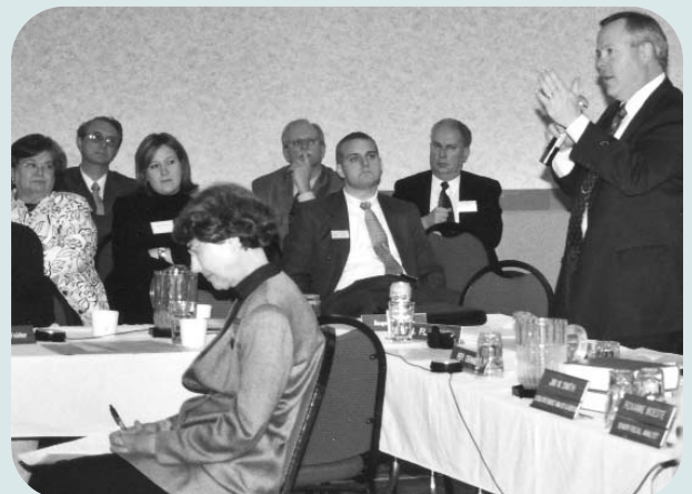
Roundtable members and guests