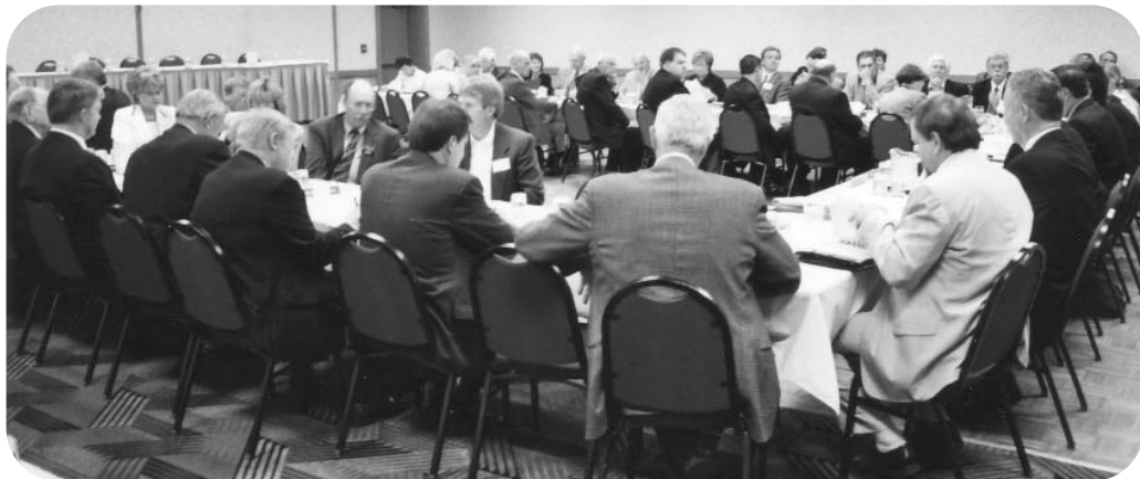
Members of the Roundtable on Higher Education review materials at the June 15, 2004 meeting.