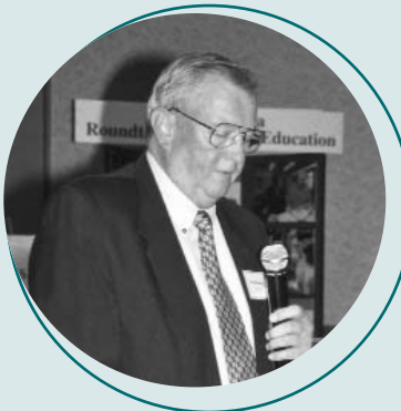
Sen. Dave Nething