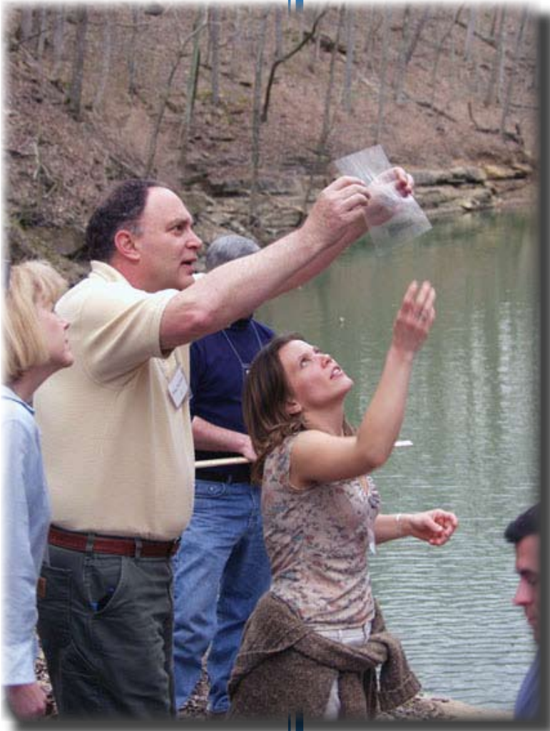
Participants in Kentucky’s first EE certification class.