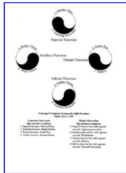
Figure 2: Archetypal Complexes Carrying the Eight Functions

The mask process concludes with building an environment or altar for the mask that can be transported to the classroom and to compose rituals to take place in that environment. Because they have to work quickly, they give up trying to figure out solutions intellectually. Several comment that while doing these last assignments they noticed that they were giving over control to the tertiary process and trusting that their creativeness would flow. One student who felt stuck for a long time said that she proceeded without letting her thinking function interfere and found that the box built itself.