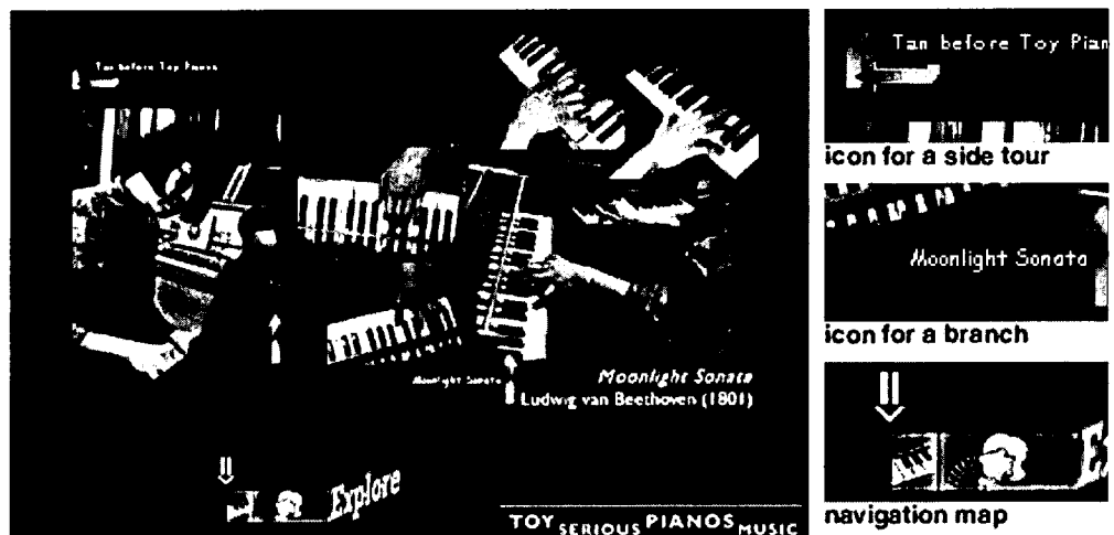
Figure 1 shows a snapshot of a tour. Most of the area is used by the content being presented by the tour (pictures, text, occasionally very short segments of video). On the bottom left side, a pictorial map gives the user a basic idea of the duration of the different scenes of the tour and the elapsed time. Rolling the mouse over the map brings extra textual information about each scene, while clicking on the picture of a scene interrupts the current scene and immediately starts the scene corresponding to the clicked image.

In our design, the main multimedia experience, or simply main tour , is enriched by the addition of user controls such as pause/resume/rewind/forward and by the inclusion of hot spots for two kinds of extra content: side tours and branches. A side tour is an extra, self-contained segment of multimedia, normally focusing on more specific aspects of the tour subject, which can be "inserted" into the main tour. A branch is a static web page with text, pictures, and links to extra information on a specific subject. The decision to create a side tour instead of a branch is based on the expected reach of the content. Since side tours are much more costly to produce than branches, we tend to produce side tours only for highly desirable extra information.