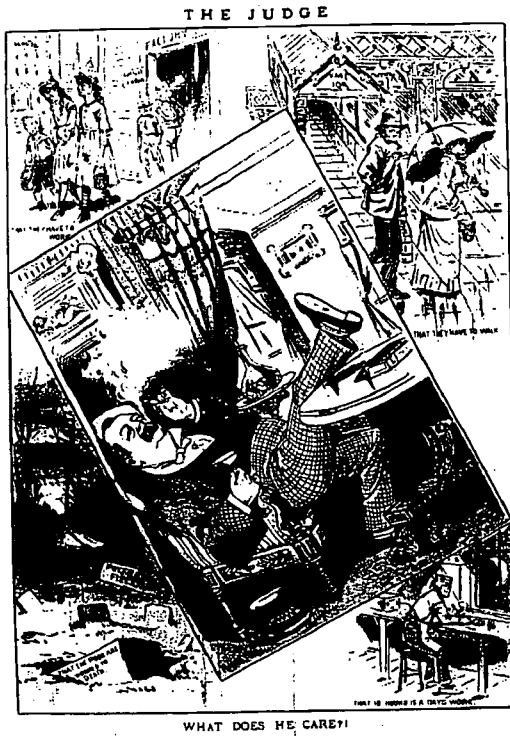
Figure 1: "What Does He Care?" The Judge , 23 August 1884, 16.