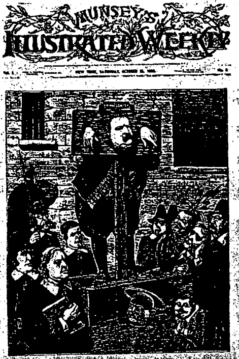
Figure 13: Cleveland in pillory, Munsey's Illustrated Weekly , 25 October 1884, 113.