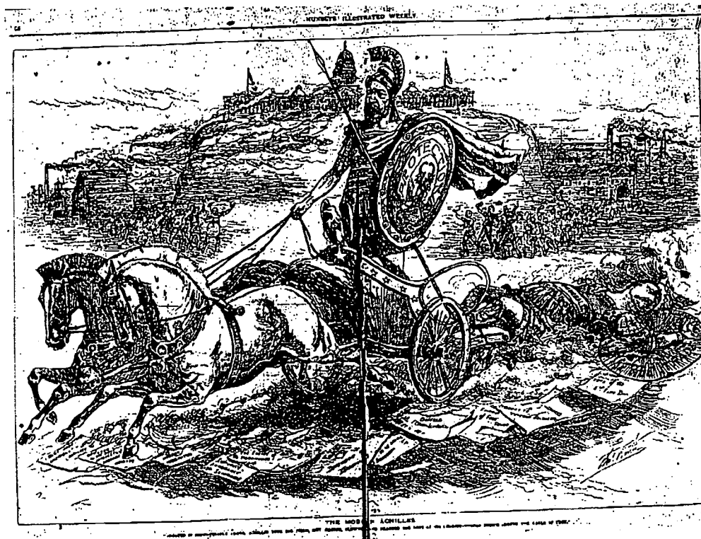
Figure 12: "The Modern Achilles," Munsey's Illustrated Weekly , 11 October 1884, 88-9.