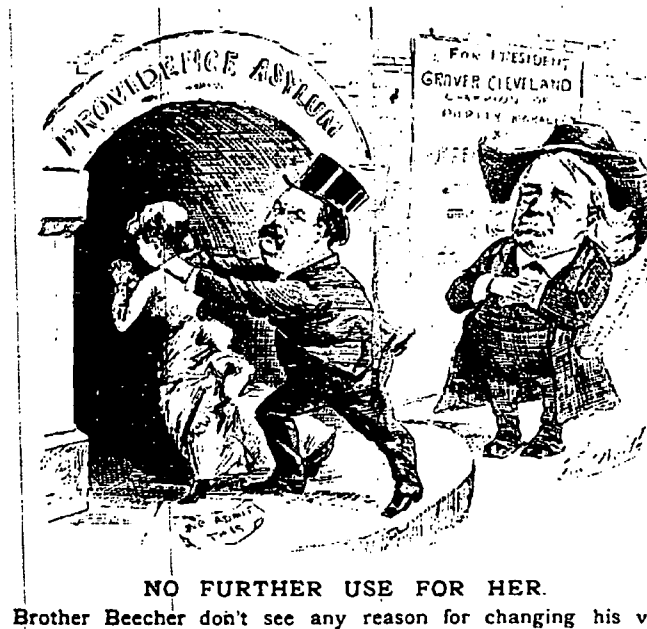
Figure 8: "No Further Use For Her," The Judge , 13 September 1884, 12.