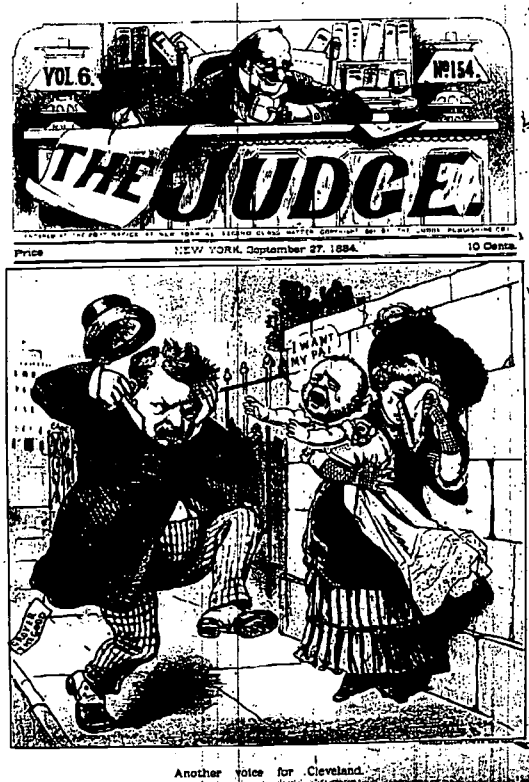
Figure 6: "Another Voice for Cleveland," The Judge , 27 September 1884, 1.