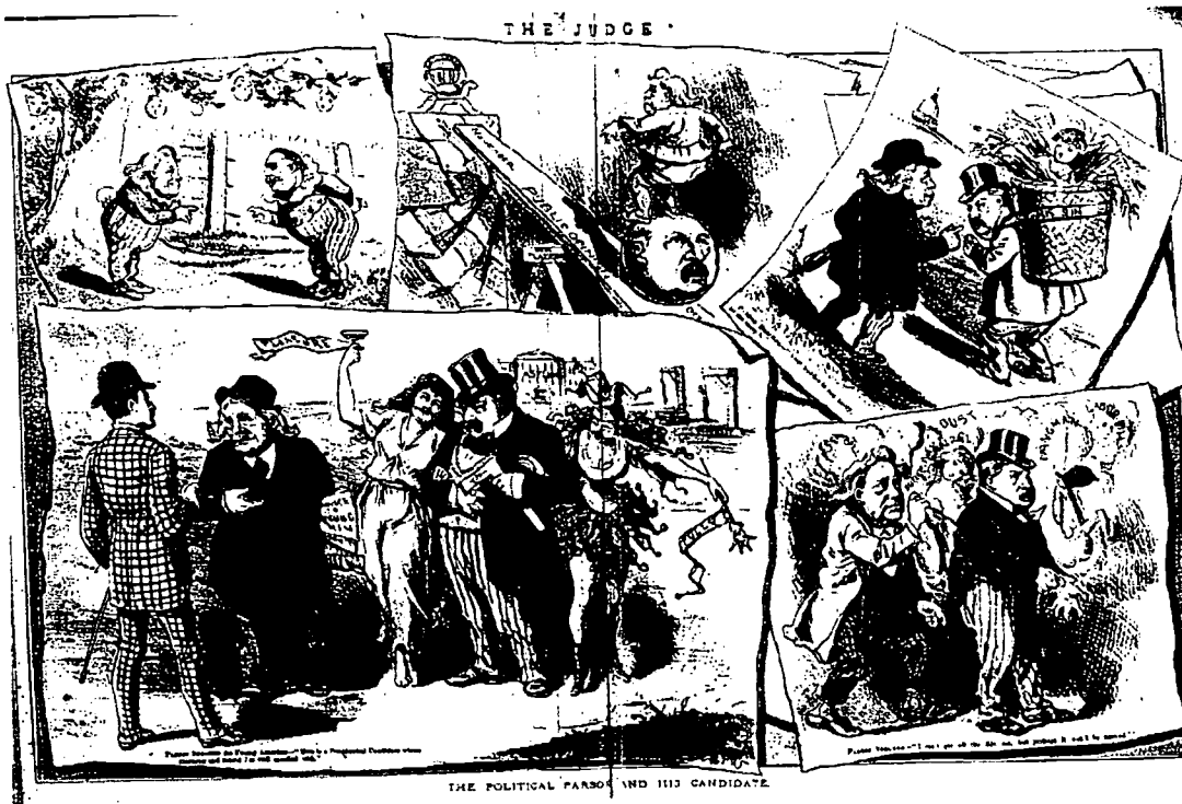
Figure 11: "The Political Parson and His Candidate," The Judge , 11 October 1884, 8-9.