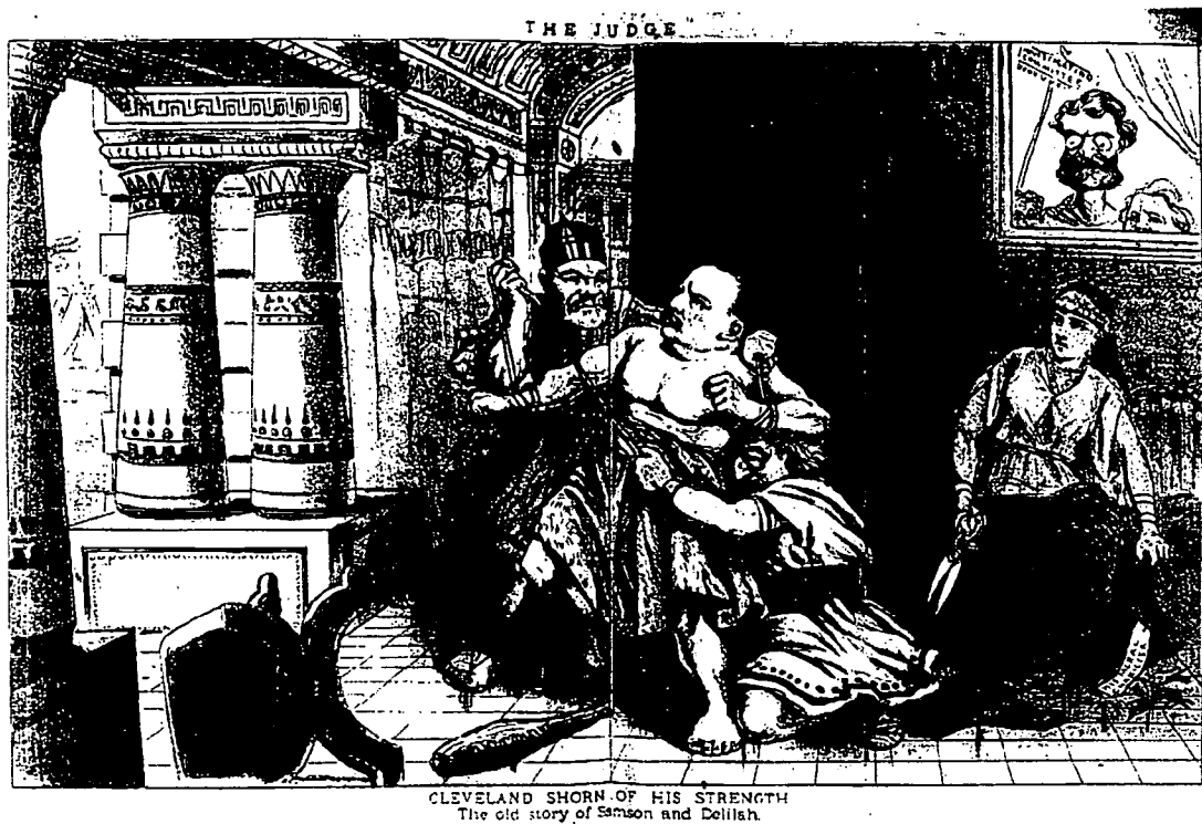
Figure 4: "Cleveland Shorn of His Strength," The Judge , 6 September 1884, 8-9.