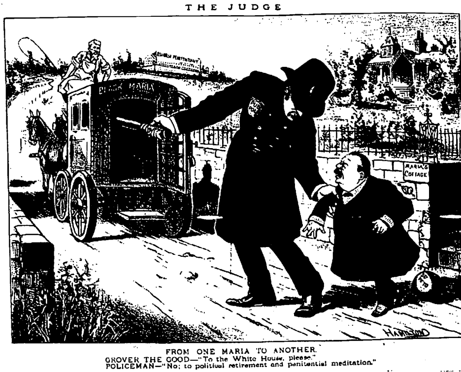
Figure 5: "From One Maria To Another," The Judge , 20 September 1884, 16.