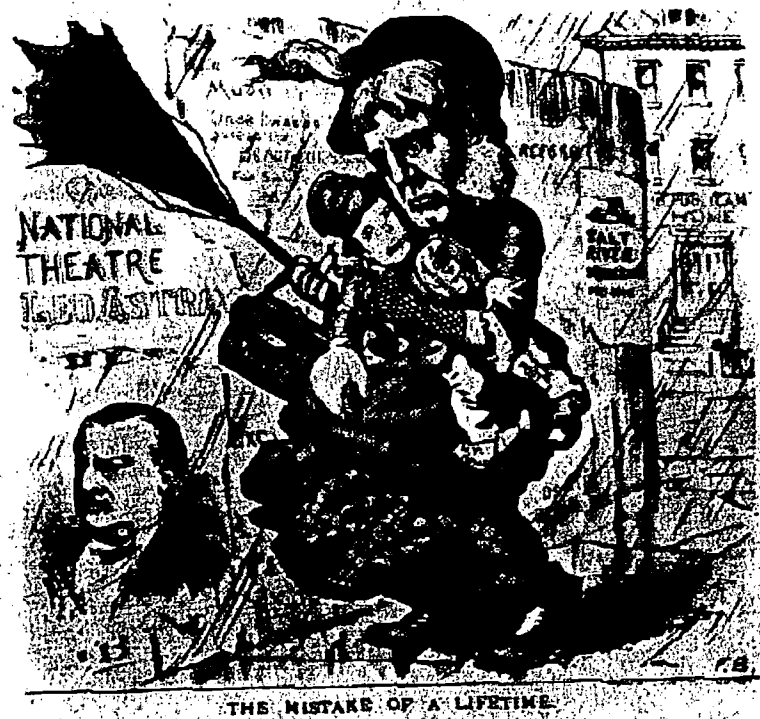
Figure 3: "The Mistake of a Lifetime," The Judge , 16 August 1884, 1.