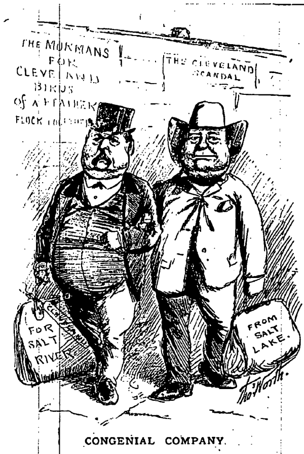
Figure 7: "Congenial Company," The Judge , 25 October 1884, 3.