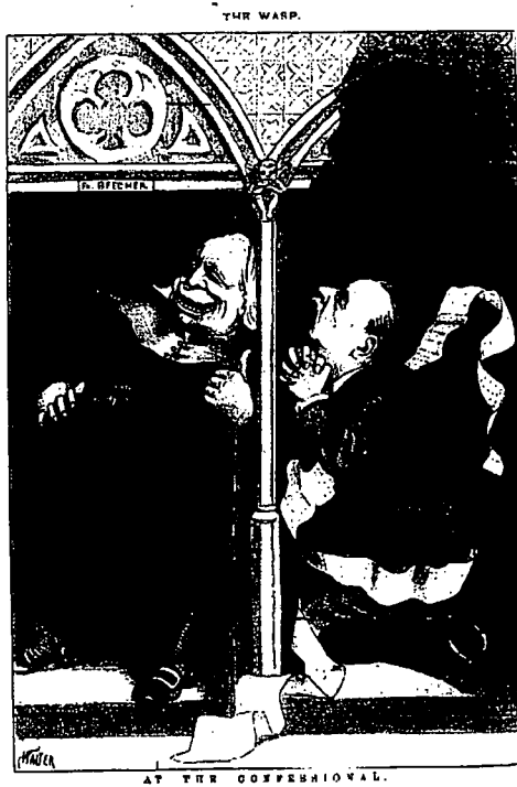
Figure 10: "At the Confessional," The Wasp , 18 October 1884, 16.