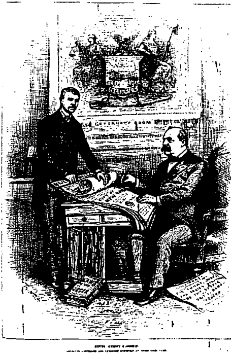
Figure 2: "Reform Without Bloodshed," Harper's Weekly , 19 April 1884, 249.