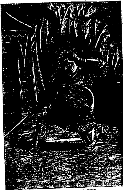
Figure 14: "Veto, Vice, Veto," Munsey's Illustrated Weekly , 25 October 1884, 125.