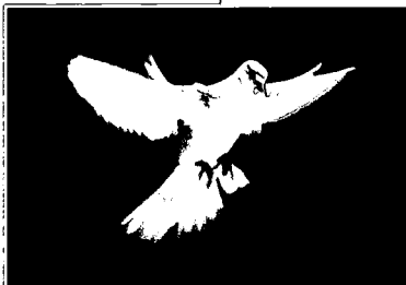
INTERNATIONAL PEACE & SECURITY