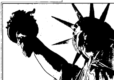
STRENGTHENING U.S. DEMOCRACY