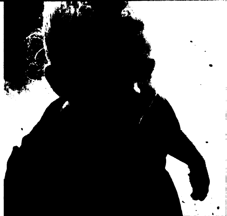
Astor Early Childhood Program, Poughkeepsie, NY

A mental health professional is assigned to each EHS center, except in our largest center (Poughkeepsie, NY) where we have the equivalent of two full-time mental health professionals and one predoctoral psychology intern. The mental health professional practices reflective supervision on a weekly basis with the parent-infant educators, either individually or in small groups. Any concerns that a parent-infant educator has about a child on her caseload is addressed during reflective supervision; if mental health expertise is requested, then a referral is generated and a formal consultation is begun. Any information such as observations and Denver II Developmental Screening Instrument results that may have already been gathered by the parent-infant educator are shared with the mental health professional. If a child appears significantly delayed in any developmental