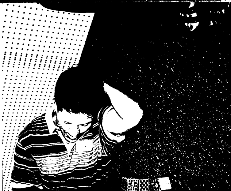
Upper Des Moines Opportunity, Inc., Spencer, IA

Data collection and assessment efforts provide another feedback loop. The center's information systems manager