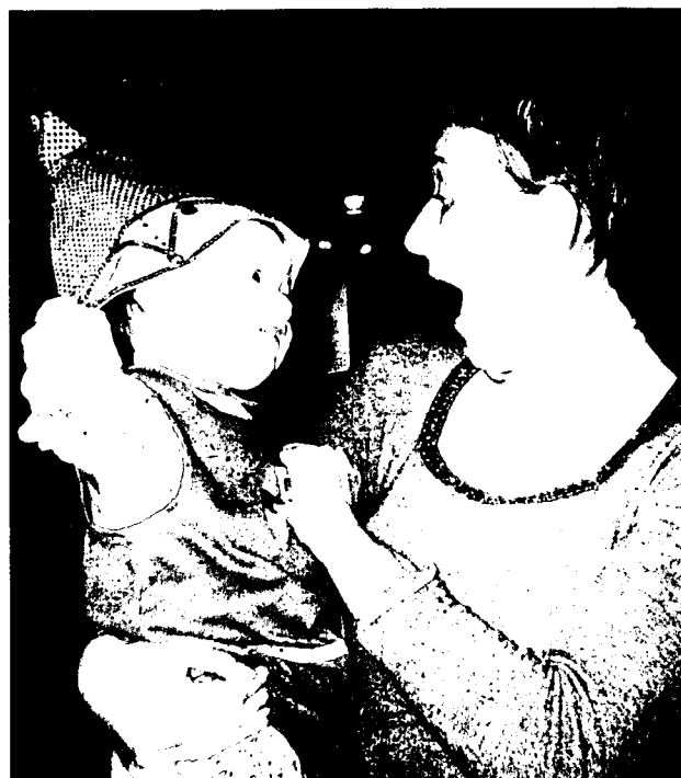
Upper Des Moines Opportunity, Inc., Spencer, IA

The management team at the Hope Street Family Center includes mental health professionals and professionals from other disciplines. With mental health staff members in leadership roles, both clinical and administrative concerns relating to mental health receive ongoing consideration in the overall planning of services for families. As mentioned above, mental health staff members participate as coleaders of weekly case conferences, unit meetings, and coordinating meetings, so mental health service planning for infants, toddlers, and pregnant women is a central rather than ancillary process. Thus, the mental health staff along with staff members from other disciplines develop an intimate understanding of