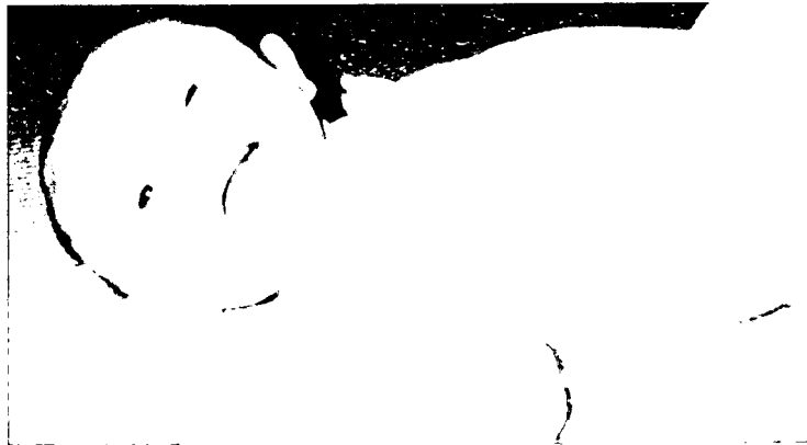
Upper Des Moines Opportunity, Inc., Spencer, IA

The prevention of burn out and other stress-related problems for staff members is an important concern, and special care is taken to hire personnel who have the fortitude and sensitivity to work effectively with families under a variety of potentially stressful circumstances.