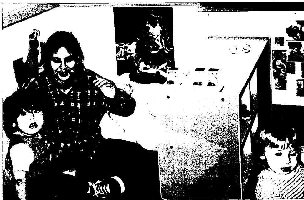
Panhandle Community Services, Gering, NE