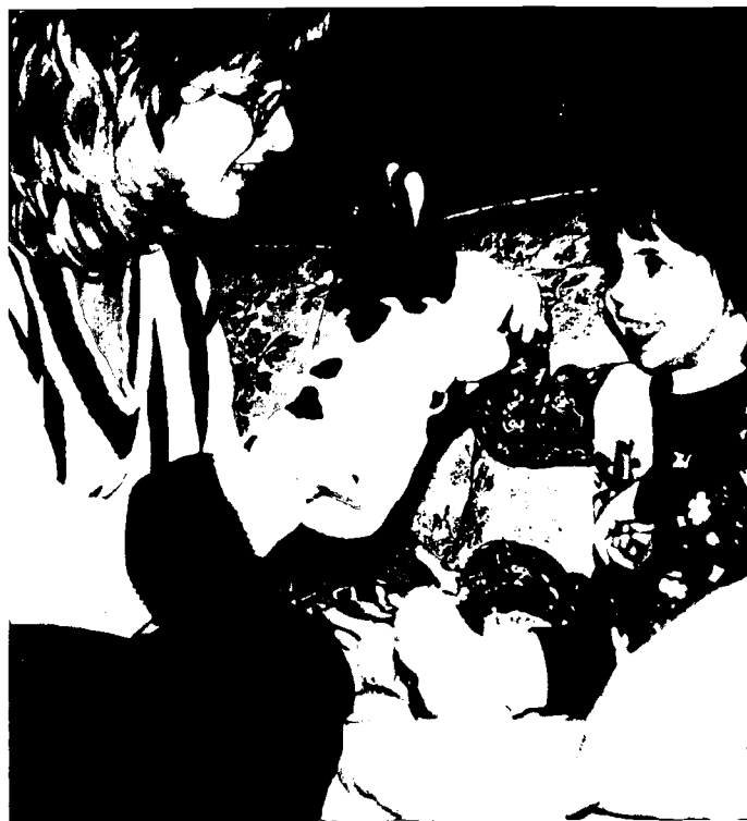
Upper Des Moines Early Head Start, Spencer, IA

Because every child is a unique blend of characteristics, infants' and toddlers' developmental pathways will reflect not only their individual constitutional differences but also the contributions of their caregiving environments.