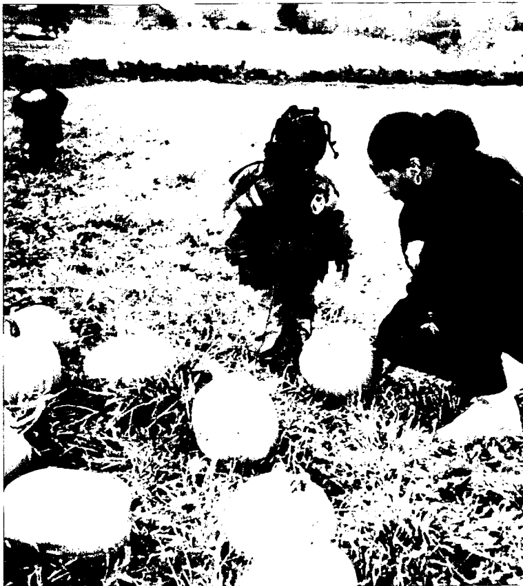
PEACE, Inc., Early Head Start, Syracuse, NY

consider the parent and help the parent meet his or her own needs.