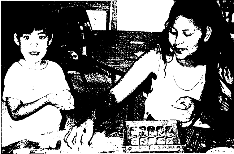
Panhandle Community Services, Gering, NE

Home visitors primarily use the following educational materials to strengthen parent knowledge with respect to the social-emotional domain: Partners for a Healthy Baby Curriculum by Florida State University; the Parents as Teachers Born to Learn curriculum; and the March of Dimes Baby and You curriculum. Staff members are encouraged to access mental health resources such as the Mental Health Took Kit on the Web site of the Head Start Information and Publications Center and the training offered through the HeadsUp Network.