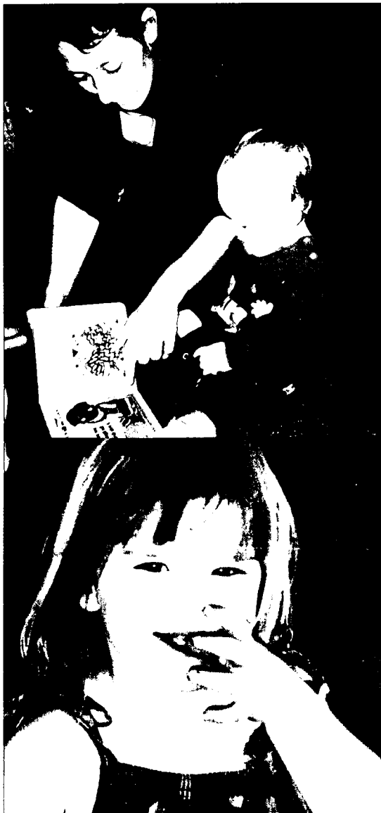
Upper Des Moines Early head Start, Spencer, IA