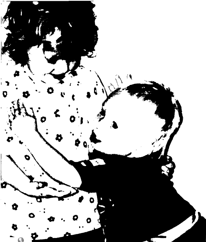
Upper Des Moines Early Head Start, Spencer, IA