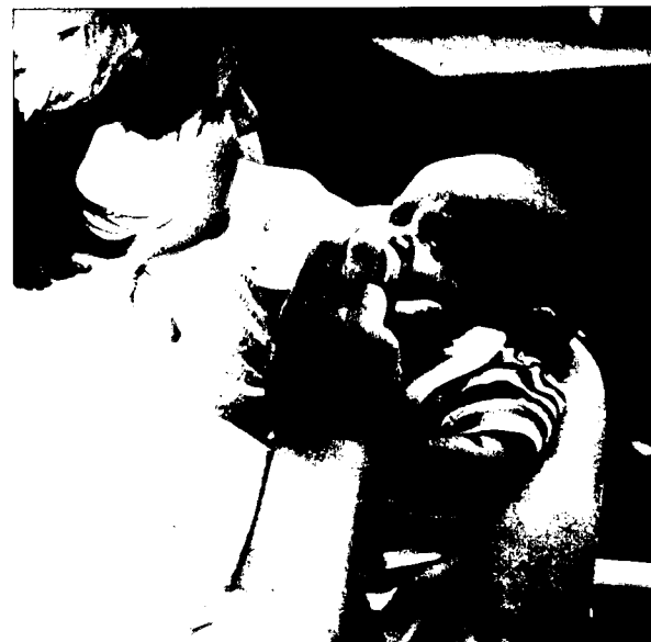
Astor Early Head Start, Poughkeepsie, NY

U.S. Department of Health and Human Services, Administration for Children and Families, Administration on Children, Youth and Families, Head Start Bureau. Head Start program performance standards and other regulations. 45 CFR Parts 1301-1306, 1308, and guidance. Washington, DC: U.S. Department of Health and Human Services.