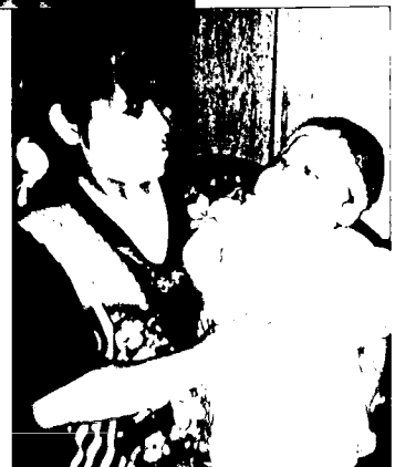
Redlands Christian Migrant Association, Immokalee, FL