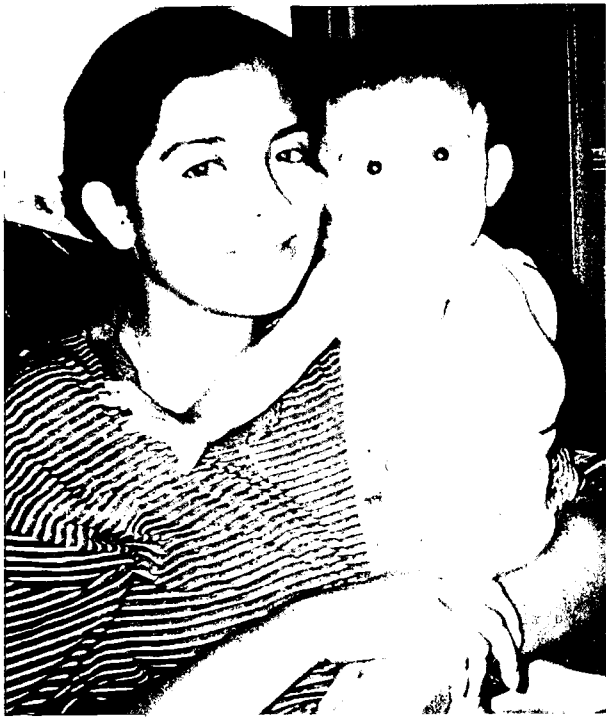
Panhandle Community Services, Gering, NE

The therapeutic relationship established between the home visitor and the primary caregiver is the foundation on which effective mental health and case management interventions depend. Finding and retaining professional home visiting staff members with the aptitude and interest to refine their interpersonal and clinical skills is critical to the multidisciplinary team approach used for mental health intervention. Whenever possible and appropriate, referrals are made to outside mental health agencies; however, the team-based approach is maintained, and outside providers become part of an integrated plan for mental health intervention rather than sole providers of the mental health intervention.