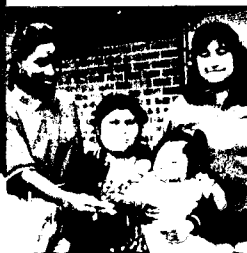
Redlands Christian Migrant Association, Immokalee, FL