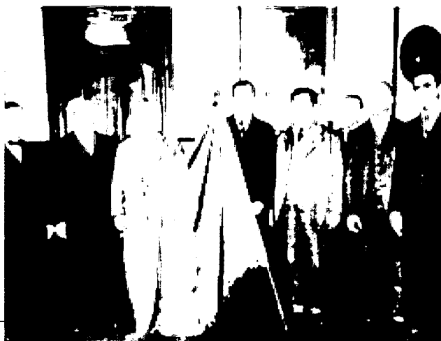
Governor George A. Parks with the Alaska Flag in Washington, D.C., 1927

Level: Middle School (grades 6-8) See "Techniques to Vary Reading" to adapt this activity for younger or older students.