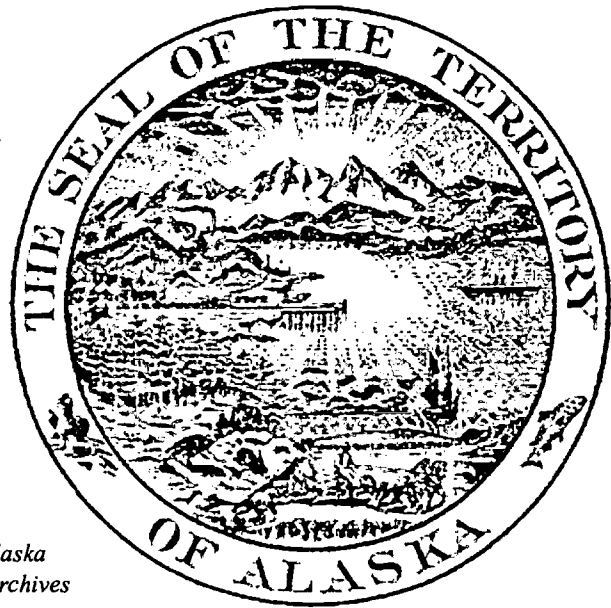
Seal of the territory of Alaska

In 1997 Public Law 105-124 authorized the U.S. Mint to initiate a national program "to provide for a 10-year circulating commemorative coin program to commemorate each of the 50 States." The short title for this law is the 50 States Commemorative Coin Program Act.