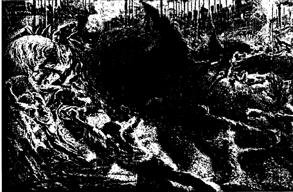
The City Rises by Umberto Boccioni, 1910

Directions: Carefully study the drawing The City Rises , by Umberto Boccioni, and then read the information below. You have five minutes to read Part 1 and study the image.