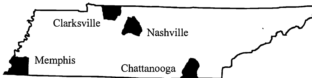
Figure 2: Tennessee Metropolitan Areas with Significant Latino Immigration

Ten years ago (in 1990), the largest number of Latinos in the state of Tennessee was concentrated in the Nashville-Davidson metropolitan area. One in three Latinos in the state lived in Nashville-Davidson County or in the counties bordering this area. Three other metropolitan areas of Tennessee had also received significant Latino immigration: Memphis, Clarksville, and Chattanooga (see Figure 2, below). Since then, there has been growth of the Latino population in cities across the state. For example, according to the Nashville Chamber of Commerce, the current population estimate in Davidson County is 45,550 Hispanics—as compared with about 8,000 in 1990. In addition, certain rural areas, such as the counties surrounding Morristown in east Tennessee, have drawn an increasing population of Latinos. Even though their numbers may not be large, the presence of Latinos in such relatively sparsely populated rural areas is especially noticeable.