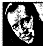
Ron Suskind Pulitzer Prize winning writer