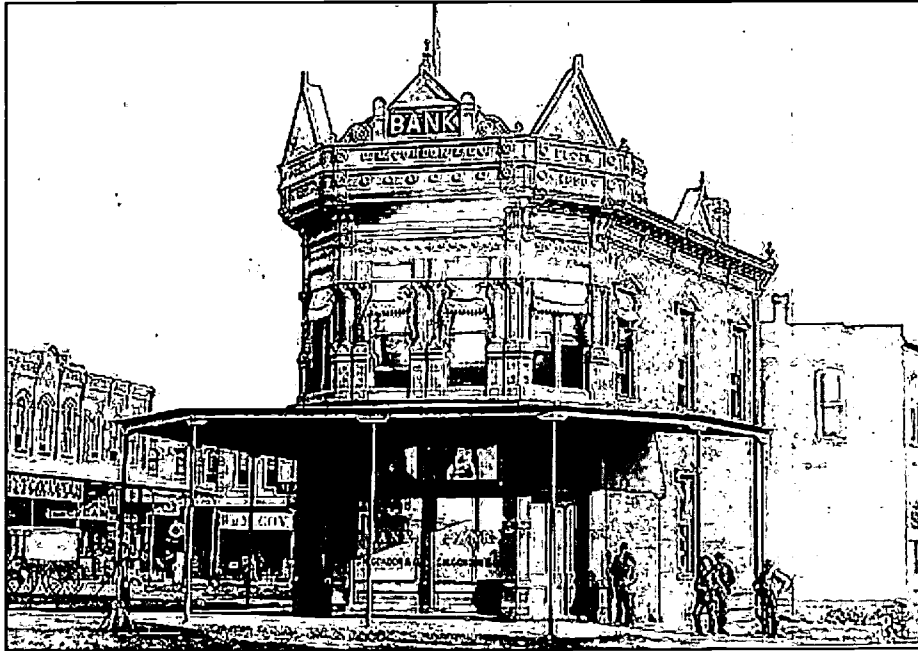
Photo 1: C. M. Condon and Company Bank, Coffeyville, Kansas, 1892.