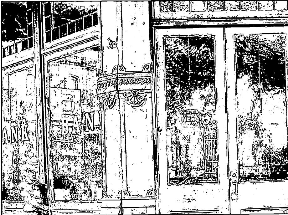
Photo 2: The front of the Condon Bank after the attempted robbery.