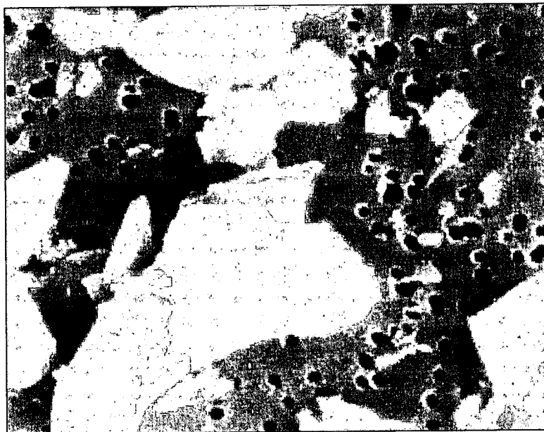
Figure 1. Detailed microscopic view of silica particles on a filter. (Scanning electron micrograph by William Jones, Ph.D.)

The silica sand used in sandblasting breaks into fine particles that stay in the air (Figure 1). If these particles are small enough to be inhaled deeply into the lungs, they are known as respirable crystalline silica. Inhaling these fine silica particles causes more lung damage than inhaling larger particles. This process causes rapid and severe forms of silicosis in sandblasters.